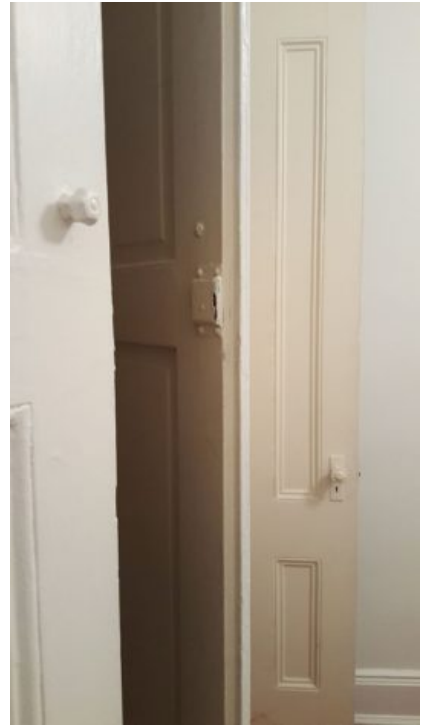
“Juxtaposed” (from the “Inside NY” Series) by Lisa di Liberto, 2016. Digital Photograph. Courtesy of the artist.