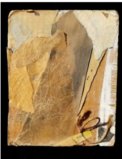
“Untitled” by Lisa di Liberto, 1980. Collage, 5 x 7 inches.