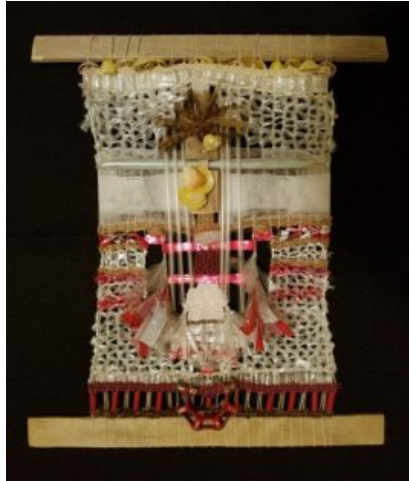
“Consumption: Repurposing My Carbon Footprint, No. 4” by Lisa di Liberto, 2019. Weaving, 14.5 x 16.75 inches.