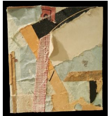
“Untitled” by Lisa di Liberto, 1980. Collage, 3 x 4 inches.