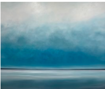
"Bostwick Bay" by Kurt Giehl, 2019. Oil on canvas, 60 x 72 inches.