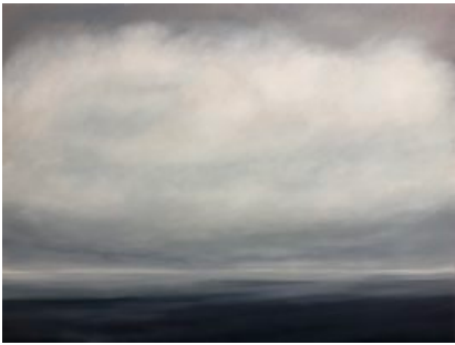
“Malibu” by Kurt Giehl, 2018. Oil on canvas, 36 x 48 inches.