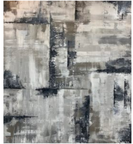
“Dark Shadows” by Kurt Giehl, 2019. Oil on canvas, 60 x 54 inches.