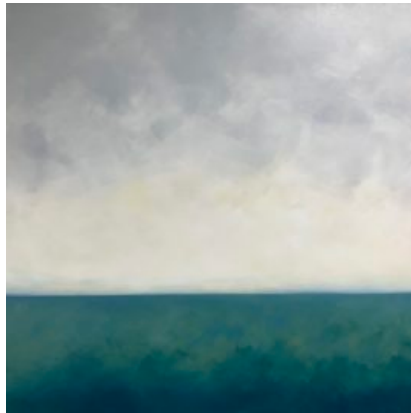
“Lily Pond” by Kurt Giehl, 2018. Oil on canvas, 48 x 48 inches.