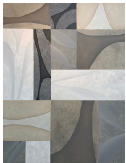
"Graphic Shape 1" by Kurt Giehl, 2019. Oil on canvas,