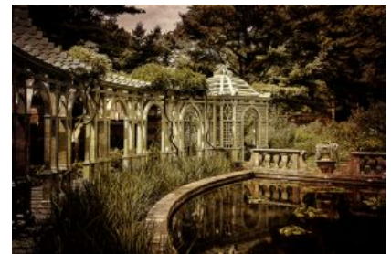
"The Lotus Pond II" by Jim Sabiston.