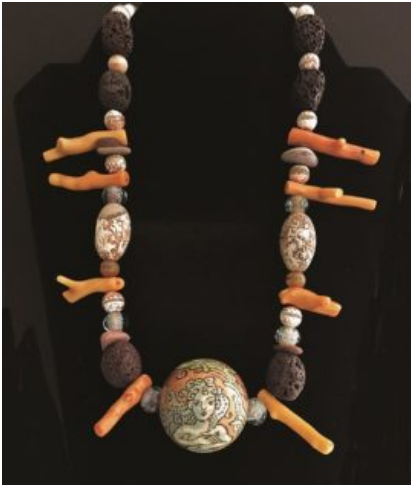
“Mermaid and Friends” by Caroline Waloski. Necklace: Heat engraved image on large wooden bead, paired with coral, agate, czech glass, lava, and beach pebbles. Large bead is 1.5 inches.