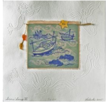
“Sirens’ Song IV” by Caroline Waloski. Etching, aquatint, blind emboss, found object, assemblage (printed from 3 copper plates), 7 x 7 inches (from a series of five images).