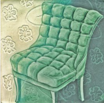
“Who’s Been Sitting In My Chair V” by Caroline Waloski. Etching, aquatint, blind emboss (printed from three copper plates), 5.25 x 5.25 inches.