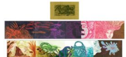
“Reptilius Sillyus” by Caroline Waloski. Etching, aquatint, chine-colle, mica (Reptile Book of prints for a Manhattan Graphics Center project). Hardcover book closed, 9.5 x 6.25 inches. Fully opened accordion on heavy text archival paper, 76 x 6.25 inches.