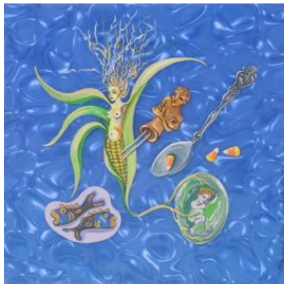
“Creamed Corn” by Caroline Waloski. Acrylic painting on psychedelic patterned translucent plastic panel, 12 x 12 inches. Courtesy of the artist.