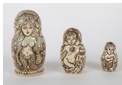
"In the Beginning" by Caroline Waloski. Heat engraved image on wooden nesting dolls box, 2 x 3.5 inches.