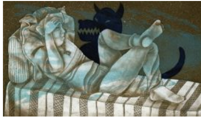
“Just Lie Down and Relax” by Caroline Waloski. Etching, aquatint (printed from three copper plates), 11.75 x 6 inches. Courtesy of the artist.