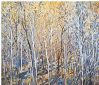
"Thanksgiving Woods" by Sally Breen. Oil on canvas, 70 x 60 inches.