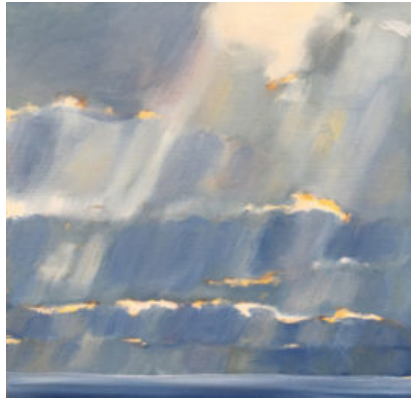
“Color Sketch 4” by Sally Breen. Oil on board, framed, 8 x 8 inches.