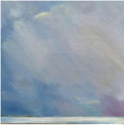
“Color Sketch 1” by Sally Breen. Oil on board, framed, 8 x 8 inches.