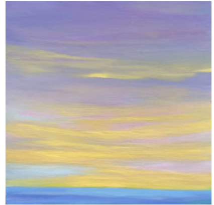
“Color Sketch 5” by Sally Breen. Oil on board, framed, 8 x 8 inches.