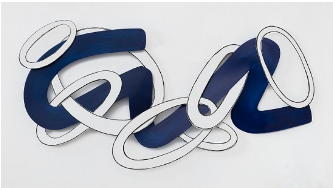
“A Complete Sentence” by Liz Sloan, 2020. Aluminum and paint, 66 x 33 x 3 inches.

Promoted as a rising star by The Hampton’s Quogue Gallery after a triumphant debut at Scope Miami during Art Basel in 2016, Liz Sloan’s most recent solo exhibit invites participants to embrace the calming energy of her pieces, take a pause, and consider the revitalizing potential of personal identity to empower us in this day and age of digital tyranny.