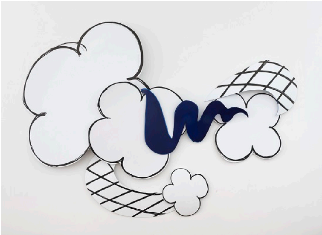
“Hashtag Signature” by Liz Sloan, 2020. Aluminum and paint, 49 x 39 x 2.5 inches. Courtesy of the artist.

Like all great art, Liz Sloan’s graceful, sinuous “Signature 2020” travels with the hopeful persistence of long-awaited roots offering a promise of spring and new growth for all human kind.