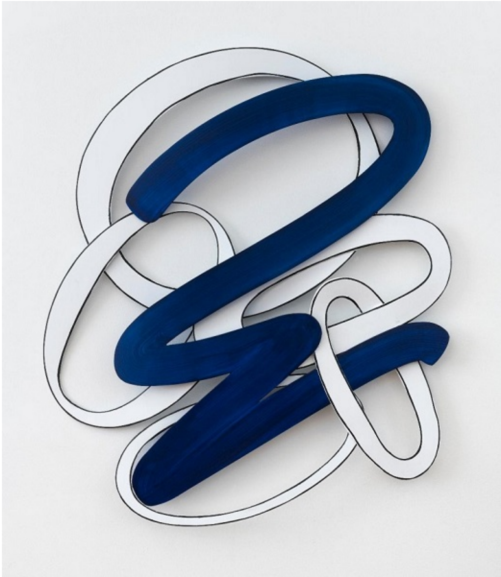
"Signature 1" by Liz Sloan, 2020. Aluminum and enamel paint, 33 x 28 x 3 inches.

"Signature 2020" will run from February 11th through March 14th, 2020 at George Billis Gallery, New York. The Opening Reception will be held on Thursday, February 13, 2020, from 6 to 8 p.m. at the George Billis Gallery, 525 West 26th Street, Ground floor, between 10th and 11th avenues in New York. For an online visit to the exhibition, visit www.georgebillis.com .