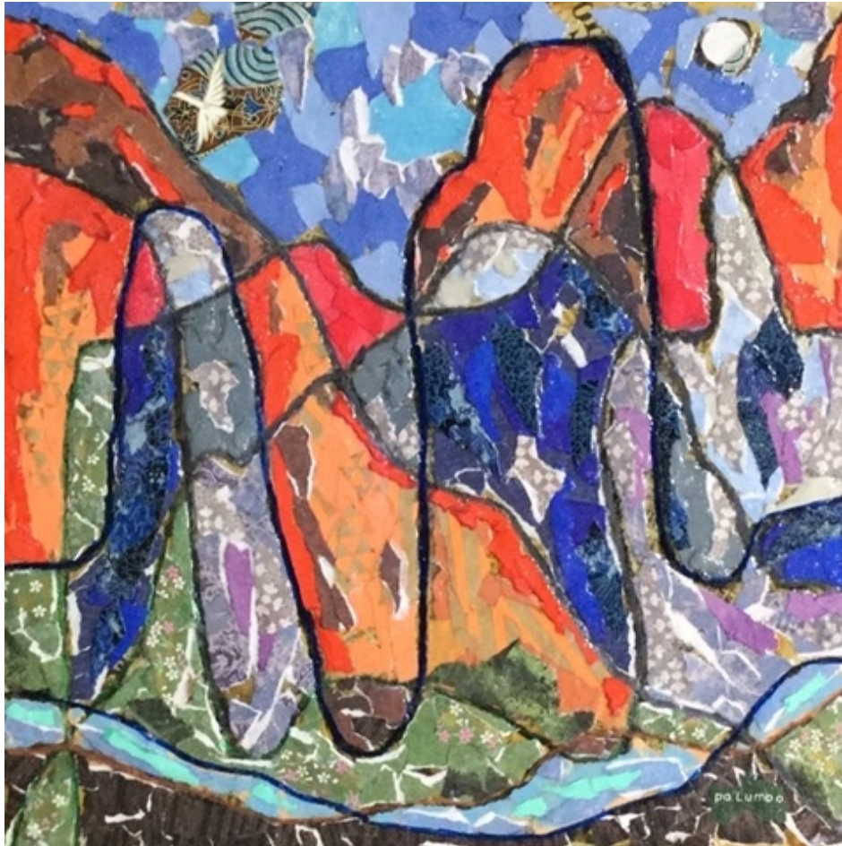
“Cimarron River” by Steve Palumbo. Torn paper on board, 12 x 12 inches.

BASIC FACTS: “Art as Gift” has an Opening Reception on Saturday, December 7, 2019, from noon to 4 p.m. at Full Moon Arts Center. The exhibition continues through December 22, 2019. Purchases can accompany the buyer at time of purchase. Full Moon Arts Center is located at 6 Moriches Avenue, East Moriches, NY 11940. For information, email info@fullmoonartscenter.org or call 631-909-4908. www.fullmoonartscenter.org .