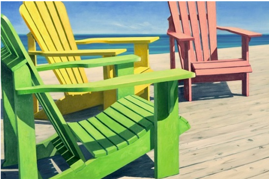
“Restless” by Peter Beston. Oil on canvas, 24 x 36 inches.

An Artists Reception, with the opportunity to meet all the members of the collective will be held on Saturday, December 7, 2019, from noon to 4 p.m. Snacks, apple cider and eggnog will be served. The gallery is located at 6 Moriches Avenue, East Moriches, NY on Eastern Long Island.