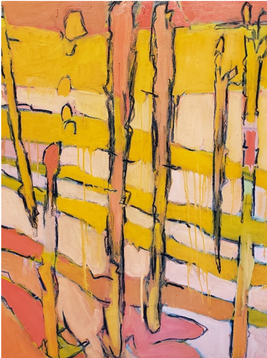
“Untitled (Fields and Furrows 6) by Robert Dash, 1998-99. Oil on linen, 60 x 45 inches. Exhibited at Madoo Conservancy.

On view from August 9 to October 12, 2019, the solo art show was a noteworthy one for the paintings selected. It was interesting to consider the exhibited work’s ties to Dash’s better known green landscapes from the sixties and seventies, demonstrating an expansion of his interpretation of local views.