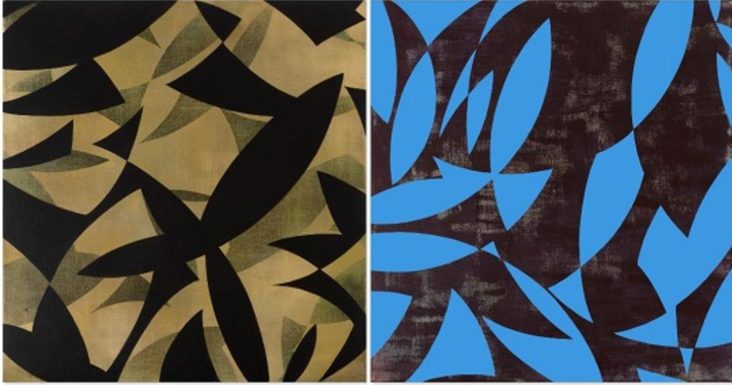
“Blackbird” by Janet Goleas, 2019. Acrylic on linen, 38 x 72 inches, diptych.