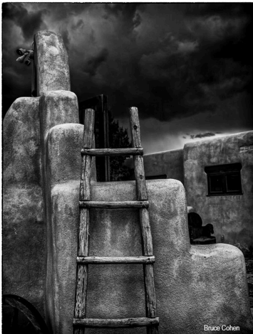
“Ladder to the Sky” by Bruce Cohen.

▪ Heckscher Art Museum exhibits “Locally Sourced: Collecting Long Island Artists” from November 23, 2019 to March 15, 2020. Museum members and invited guests are invited to attend the Opening Reception on Saturday, November 23, 2019, from 5:30 to 7:30 p.m.