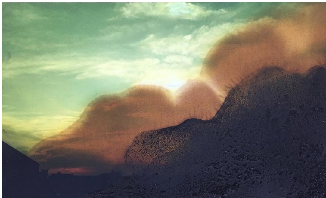
“Oil and Coal Storm over the Bay” by Maggie Cardelús, 2019. Oil and charcoal on photographs printed on museum quality rag paper, 9.84 x 16.14 inches.

Maggie Cardelús is a Paris based, American/Spanish artist and designer. For her photo-based wall pieces, sculpture, installations, video, and performance pieces, she relies heavily on meticulous handcraft to explore the formal, material, and psycho-socio-mnemonic forces at work within and around photographic images.