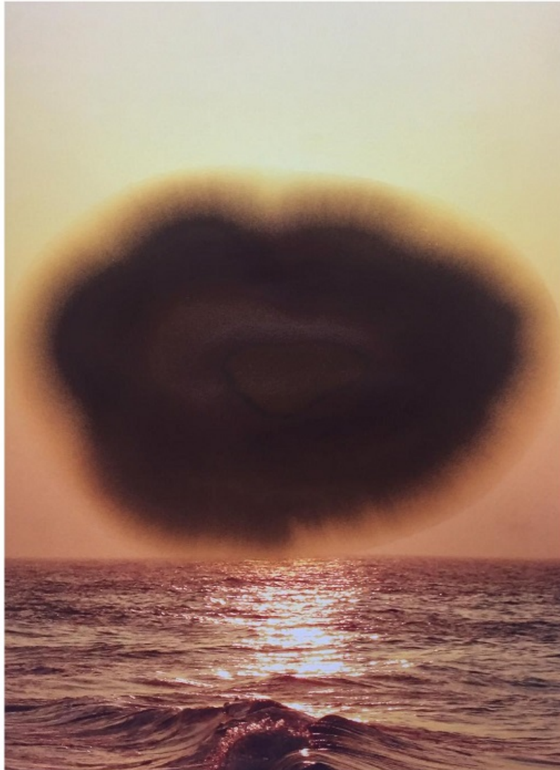
“Sky Spill” by Maggie Cardelús, 2019. Oil and charcoal on photographs printed on museum quality rag paper, 24.02 x 17.72 inches.