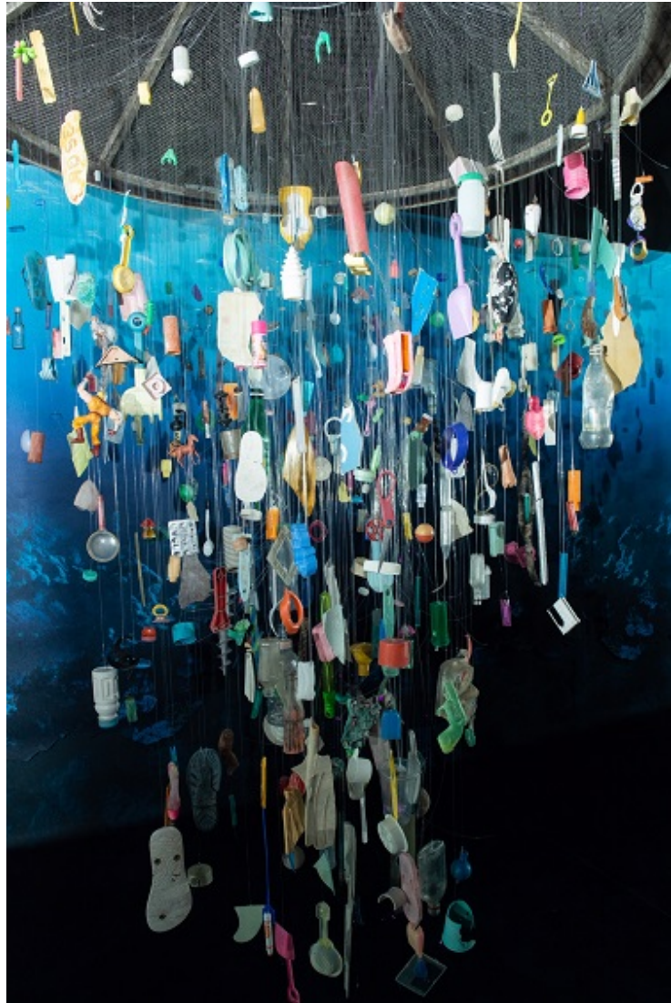
“Pieces of You: Much Ado About Something” by Cindy Pease Roe, 2018. The chandelier is made up of marine plastics (collected on Long Island) woven with fiber optic lighting. On view at Acadia.Earth in Miami.