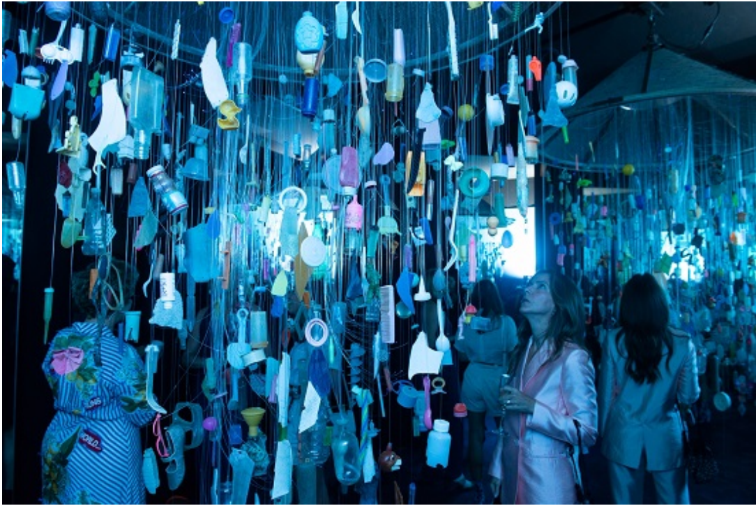
"Pieces of You: Much Ado About Something" by Cindy Pease Roe, 2018. The chandelier is made up of marine plastics (collected on Long Island) woven with fiber optic lighting. On view at Acadia.Earth in Miami.