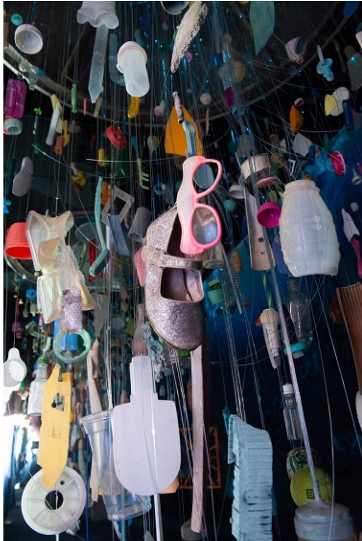
Detail of “Pieces of You: Much Ado About Something” by Cindy Pease Roe, 2018. The chandelier is made up of marine plastics (collected on Long Island) woven with fiber optic lighting. On view at Arcadia.Earth in Miami.

BASIC FACTS: “RE THINK Art Basel” takes place during Art Basel Miami Beach Week 2018 presented by Arcadia.Earth, located at 3700-3740 NE 2nd Ave Miami, FL 33137. The installation is on view from December 3 to 16, 2018. Click here for details.