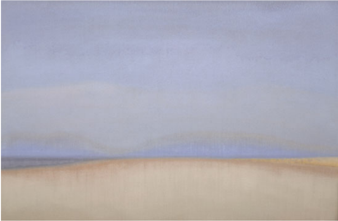
“Untitled (Lavender/Gold)” by Susan Vecsey, 2018. Oil on linen, 48 x 74 inches.