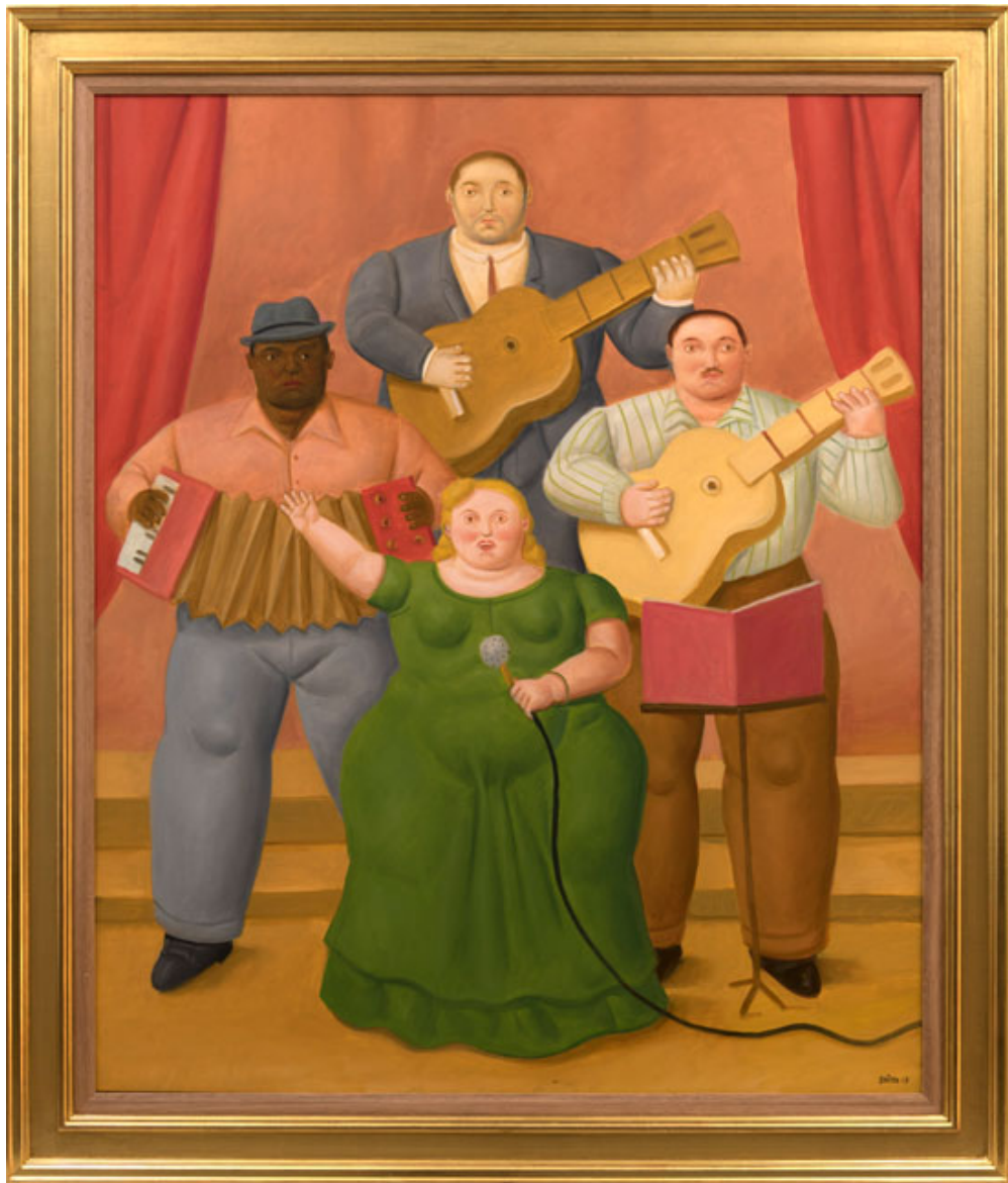
"Musicos y cantante" by Fernando Botero, 2017. Oil on canvas, 46 x 38 1/8 inches.