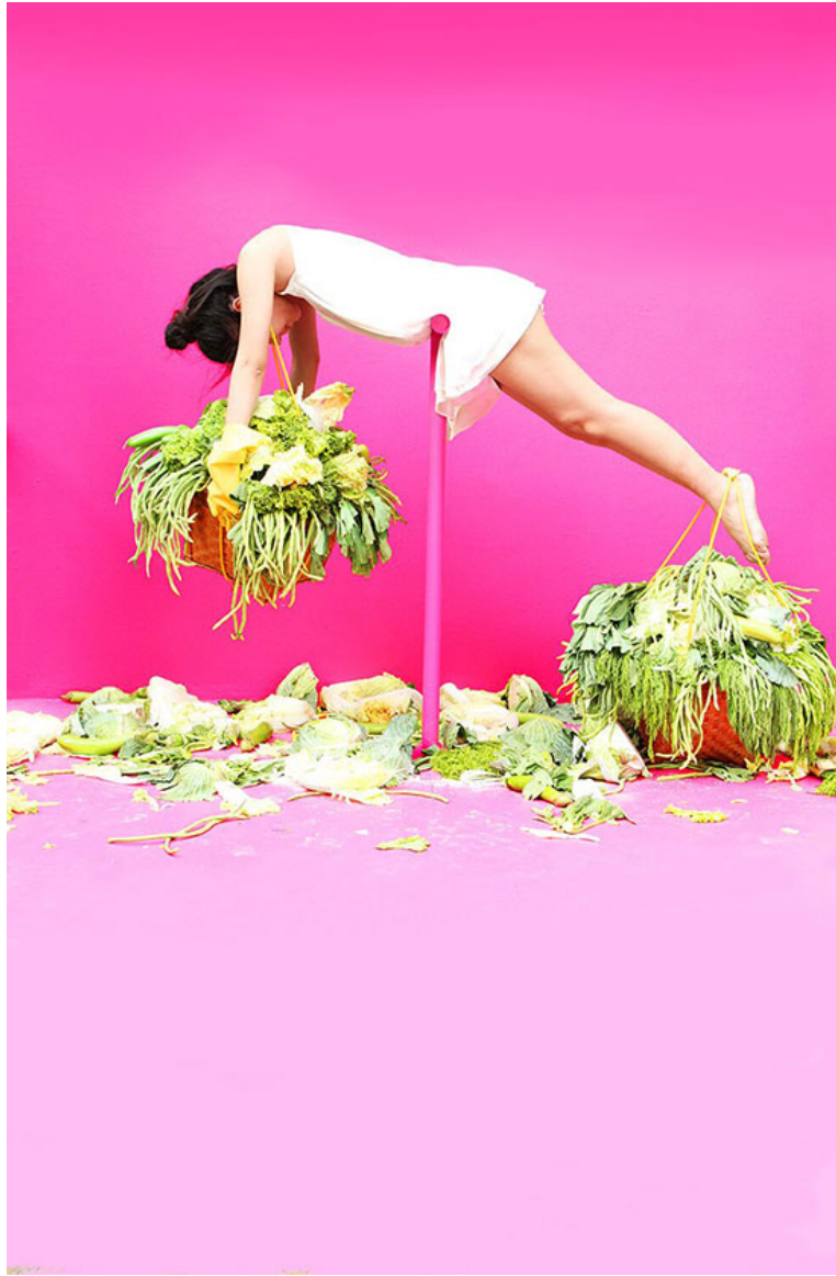
“The Scale of Justice” by Kawita Vatanajyankur, 2017. Print and video, Edition of 4 +2 AP’s, Inkjet printed on Premium Satin Photo paper, 15 x 30 inches. Curated by Alexandra Fanning.