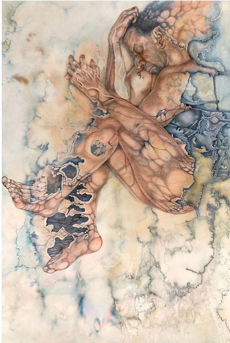
“Incubation” by Anthony Klinger-Cooley, 2018. Colored pencil, watercolor, 38 x 26 inches.

Art featured in the Long Island Biennial can be viewed online by clicking here . In addition, the museum presents artwork by all the artist applications in an online gallery that can be viewed by clicking here . The artists featured in the exhibition will gather on September 16, 2018 from 1 to 3 p.m. for a Gallery Talk at The Heckscher. Museum members are admitted free; admission is $5 for non-members. The exhibition remains on view through November 11, 2018.