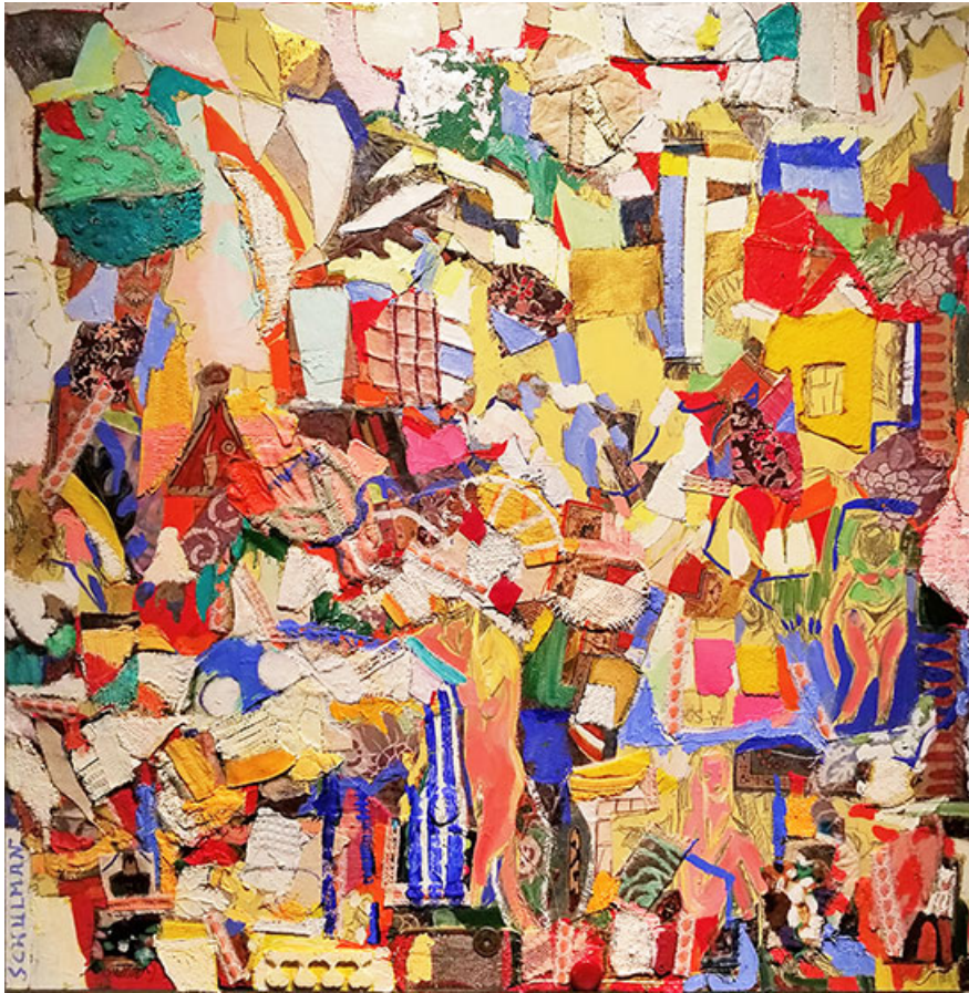
“Blue Angel” by George Schulman, 2018. Oil paint, graphite, fabric, gold and palladium leafing on wood, 33 x 33 inches.

Inaugurated in 2010 by The Heckscher Museum of Art, the “Long Island Biennial” is designed to offer the opportunity for professional artists on Long Island to be part of the Open Call juried exhibition. The show also offers a snapshot of some of the art that’s being made on Long Island at the time of the biennial.