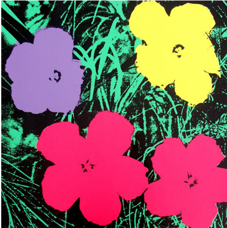
“Sunday B Morning Flowers” by Andy Warhol.