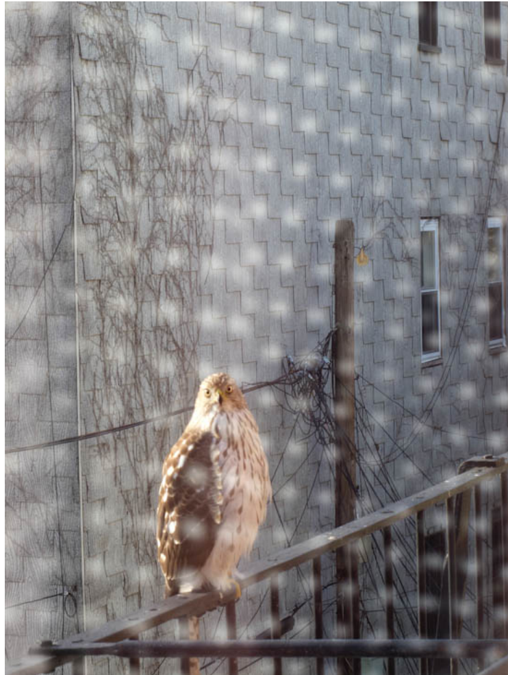
“Cooper’s Hawk on Fire Escape, South Slope, Brooklyn, NY” by Matthew Jensen, 2017. C-Print, 9 x 12 inches. Courtesy of the artist and Open Source Gallery.