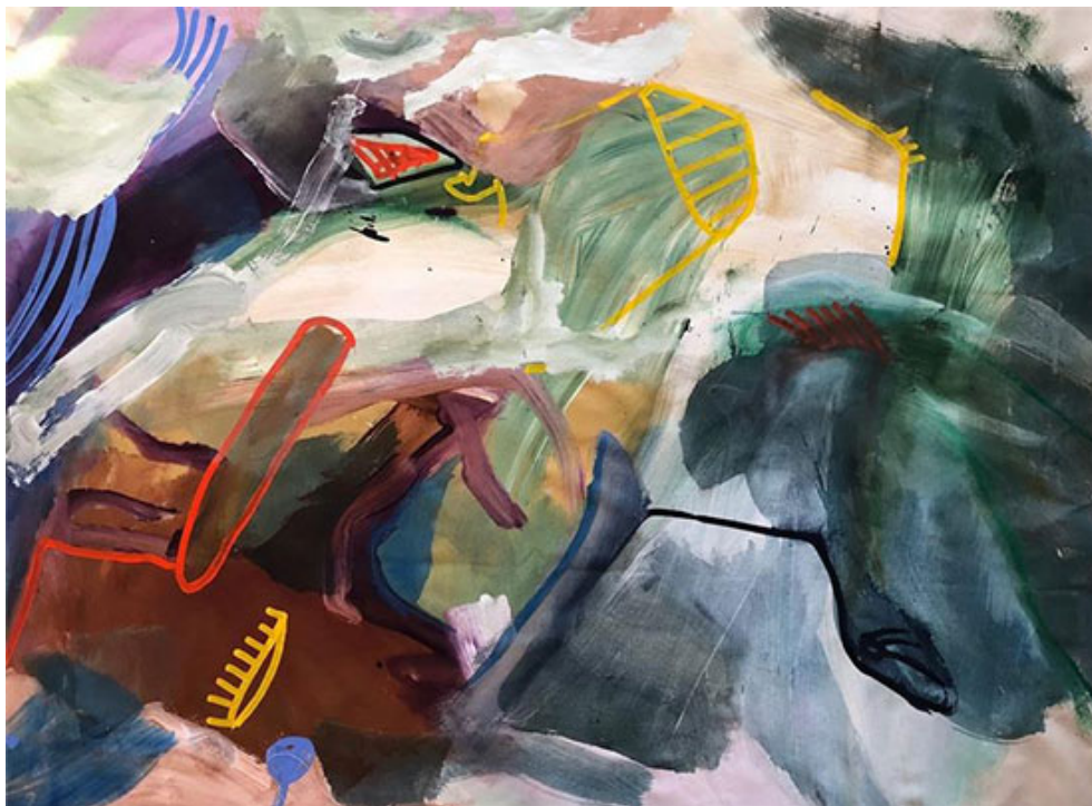
“Running With Sonny” by Tommy May. Acrylic on canvas, 44 x 62 inches. Courtesy of Quogue Gallery.

With a focus primarily on painting, works on paper and alternative photography, May’s work explores multiple viewpoints of the landscapes that surround him. He interprets his immediate environment in an abstract expressionist style with the use of strong blocks of color, energetic brush strokes, symbols and motifs.