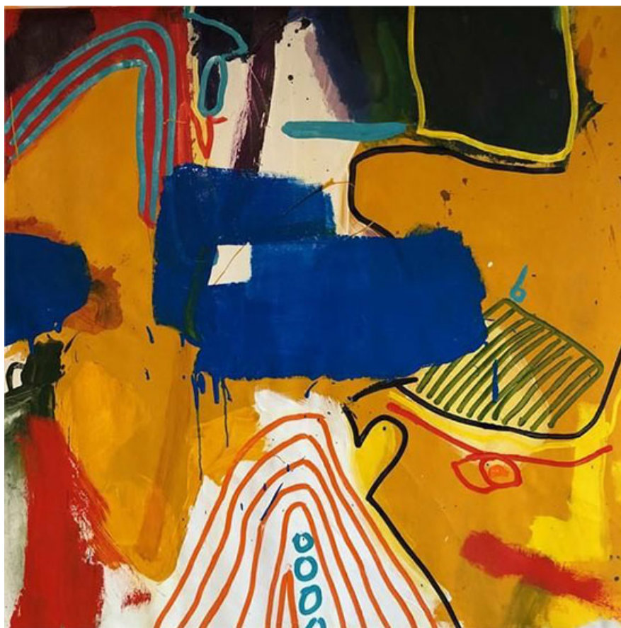
“Chateau Lobby” by Tommy May, 2018. Acrylic on canvas, 48 x 48 inches.