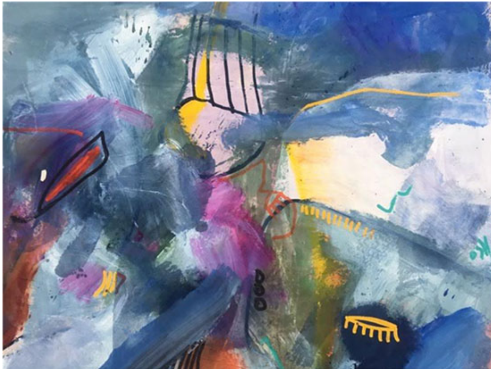
"Wading for Dinner" by Tommy May. Acrylic on canvas, 68 x 64 inches.

The artist's early paintings were landscapes of Martha's Vineyard. Like his photographs, these early paintings began to wash into abstraction until they were only fields of color. He experimented once again with line and symbols in his work. His current body of work again focuses on color, symbols, abstracted landscapes and automatic drawings.