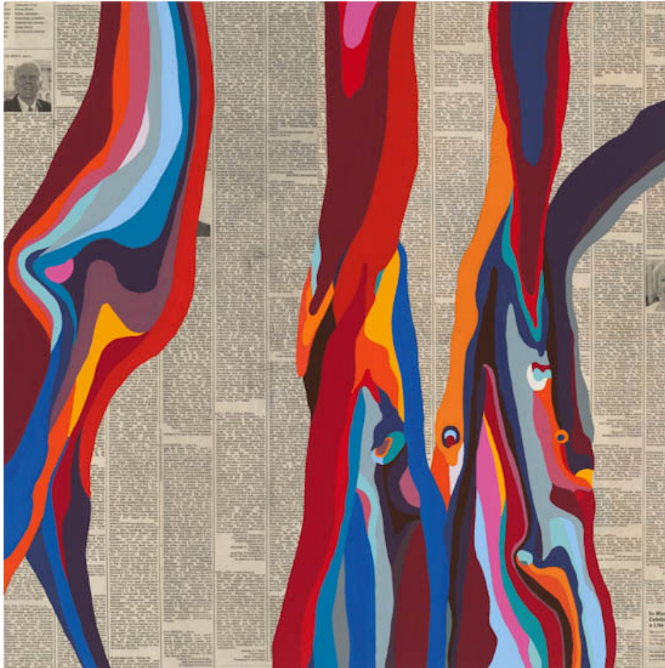
“After All” by Beth Reisman, 2017. Acrylic and newspaper on panel, 18 x 18 inches.