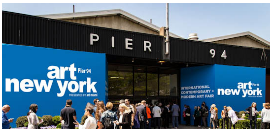
Pier 94.

Pier 94, 12th Avenue at 55th Street, New York, NY 10019. www.artnyfair.com .