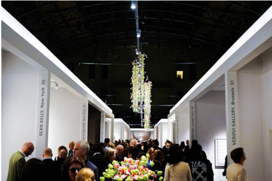
PREVIEW - TEFAF NEW YORK SPRING.