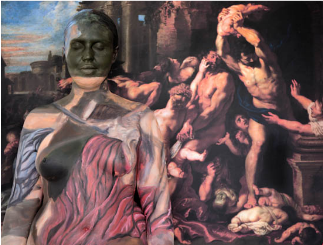
"$76,700,000 (Rubens)" by Trina Merry, 2017. $650.