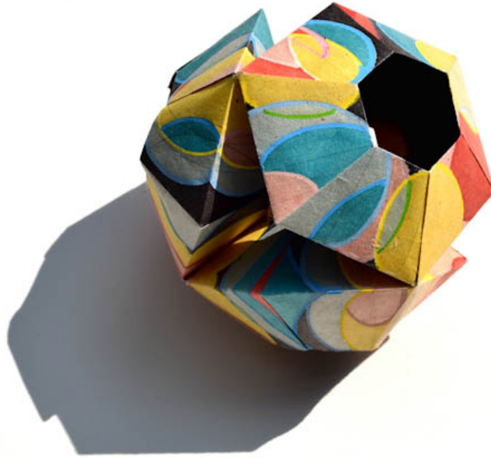
“Bubble” by Andrew Ooi, 2017. Acrylic & Ink on Gampi Chiri, 3 x 3 x 3 inches. Presented by Box Heart Gallery.

Whatever your taste, you’ll fall in love with art at Superfine! NYC, and have a good time doing it.