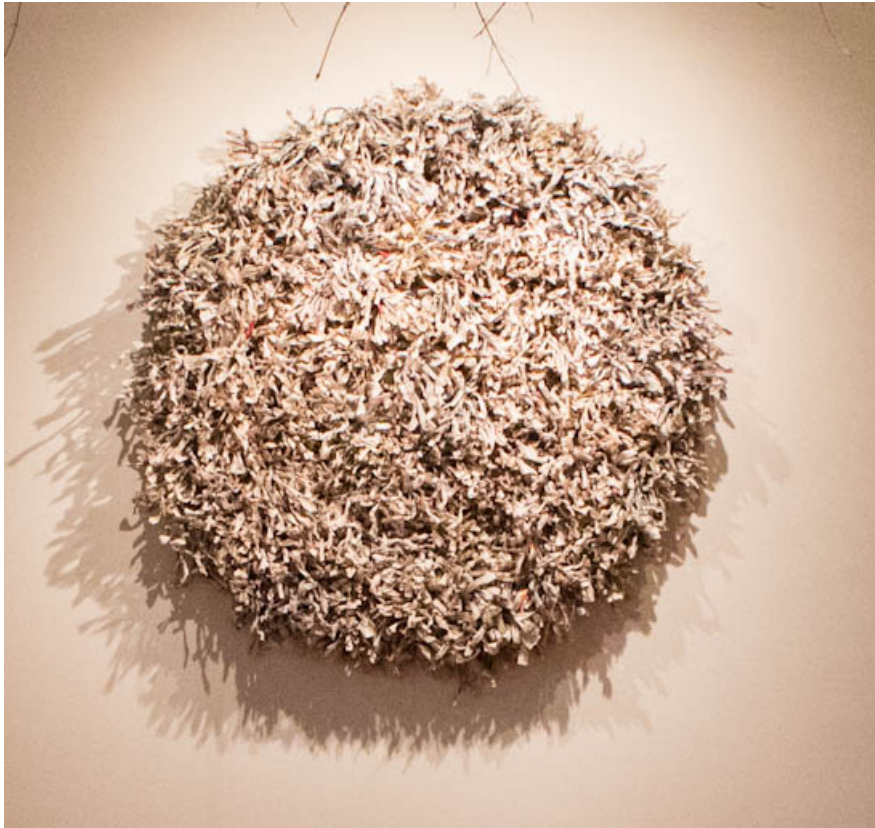
"Wrenching News" by Maren Hassinger, 2008/2015. Shredded, twisted and wrapped New York Times newspapers. 72 in. dia.(MH0009).