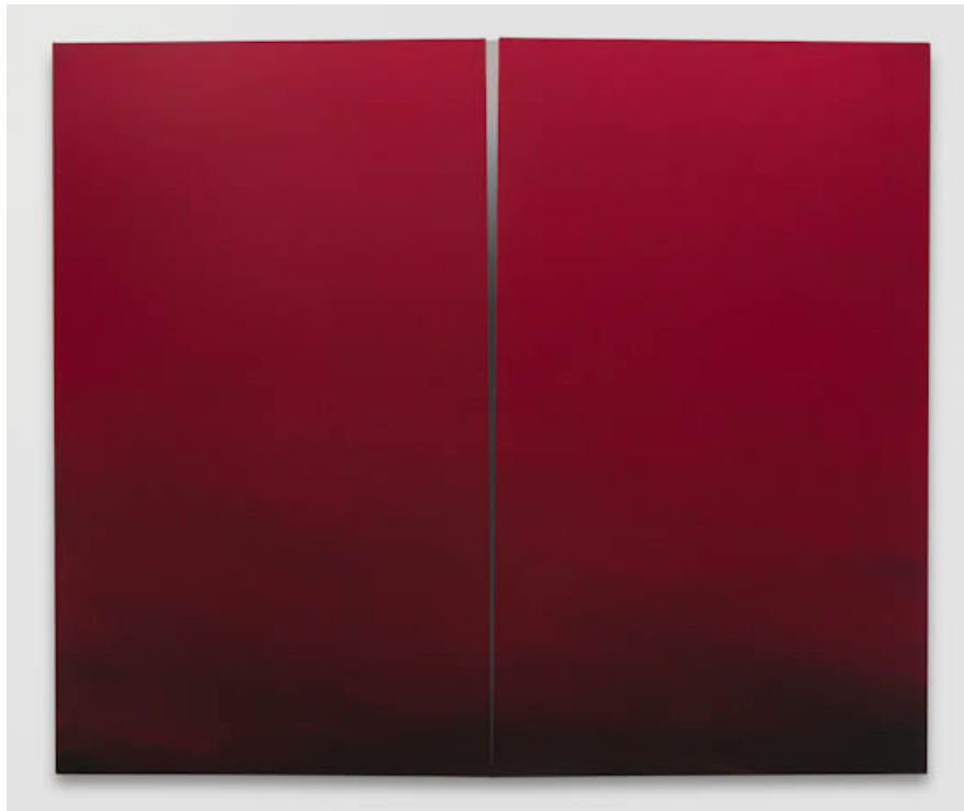
"Crimson Sky Split" by Mara De Luca, 2018. Acrylic on canvas over panel with polished aluminum element, 72 x 84 inches (183 x 213 cm).