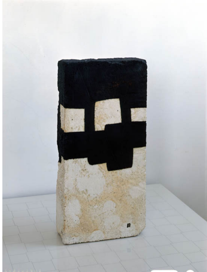
“Cemento G-152” by Eduardo Chillida, 1989. Chamotte clay, copper oxide, 46 x 21 x 8 cm / 18 1/8 x 8 1/4 x 3 1/8 in. © Estate of Eduardo Chillida. Courtesy of the estate and Hauser & Wirth.

NYC Gallery Scene - Highlights publishes weekly with exhibitions selected by Hamptons Art Hub staff. This edition was selected by Kathryn Heine and written by Genevieve Kotz. Click here to visit our Gallery Guide to find more exhibitions on view.