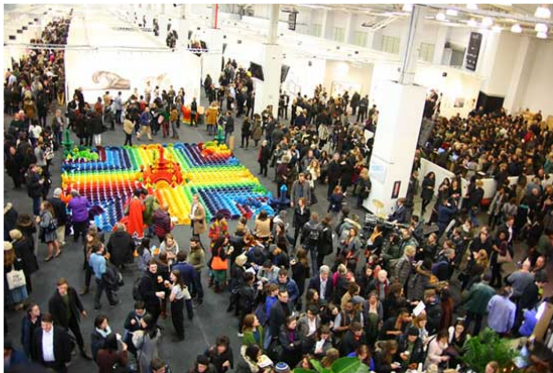
Art On Paper 2017.

Art on Paper is being presented at Pier 36, New York, NY 10013. www.thepaperfair.com .