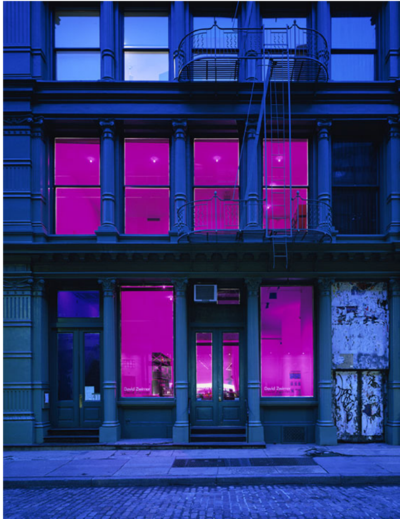
David Zwirner, 43 Greene Street, New York, 2001 (during the exhibition “Diana Thater: The sky is unfolding under you”).