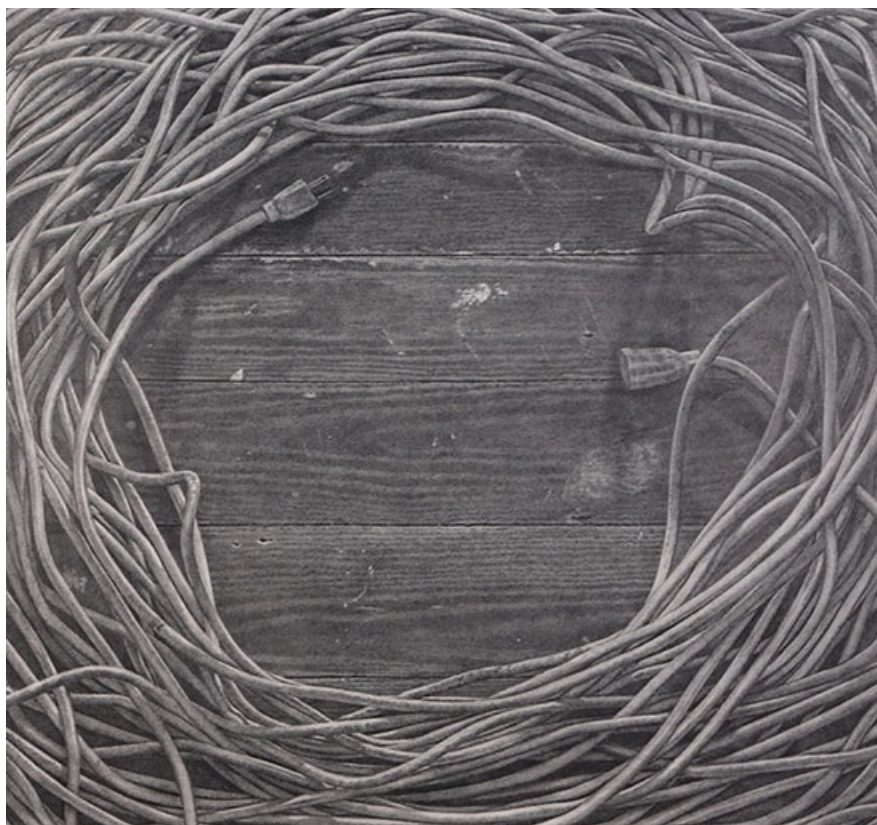
"Studio Floor" by Catherine Murphy, 2015. Graphite on paper, 28 3/4 x 31 3/16 inches. Courtesy the artist and Peter Freeman, Inc.