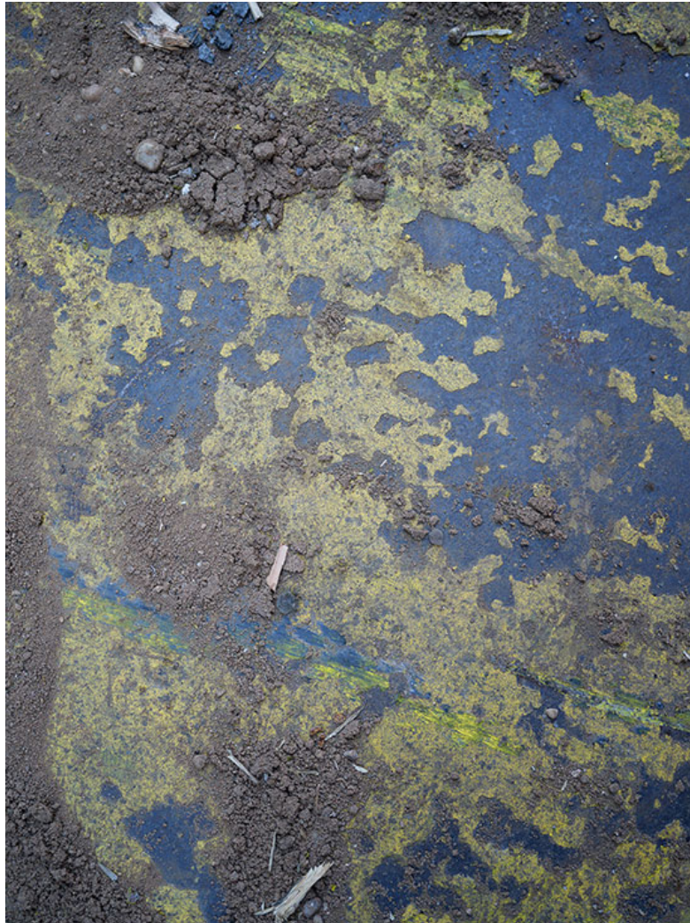
“New York, New York, May 19, 2017” by Stephen Shore, 2017. Pigment print, 64 x 48 inches.