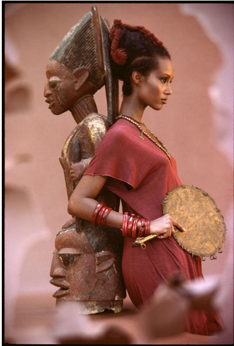
“Untitled” by Gordon Parks, 1978.