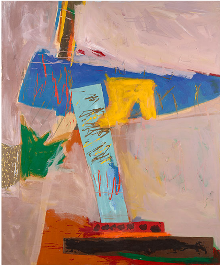
“Gypsy Wind” by Ann Purcell, 1983. Acrylic and collage on canvas, 72 x 66 inches.