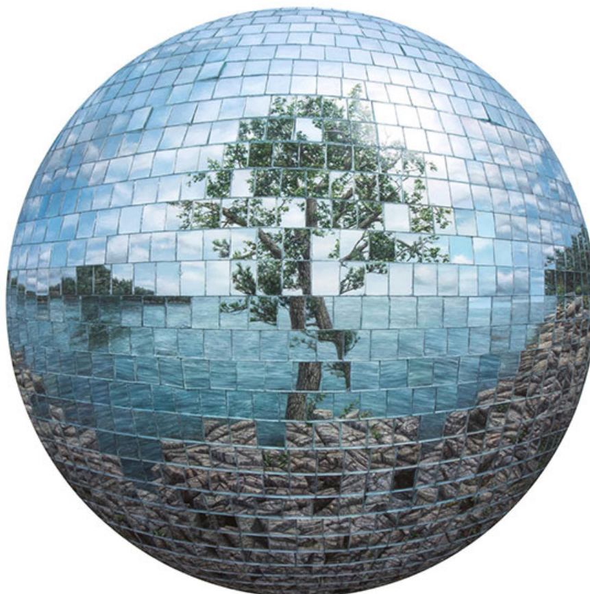
“Party On” by Clive Smith, 2017. Oil on Canvas, 65 inches diameter.