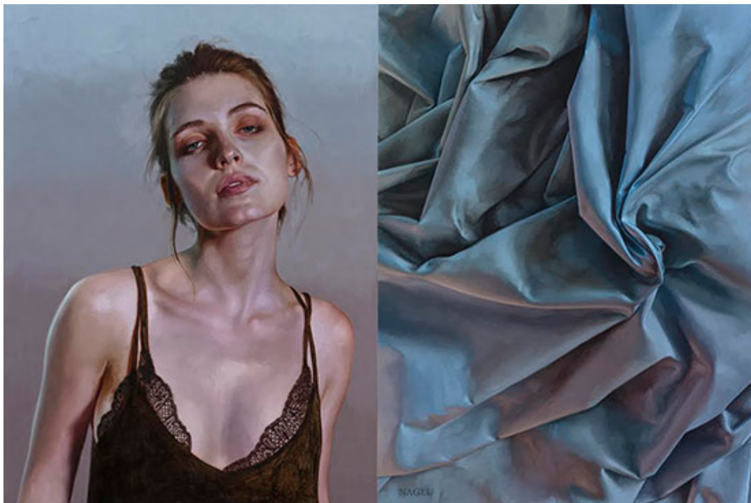
“Signal to Noise I” by Aaron Nagel, 2017. Oil on panel, 36 x 24 inches.