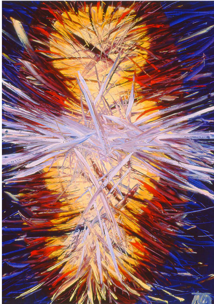
"Mummy I" by Thomas Bühler. Oil, 40 x 30 inches.