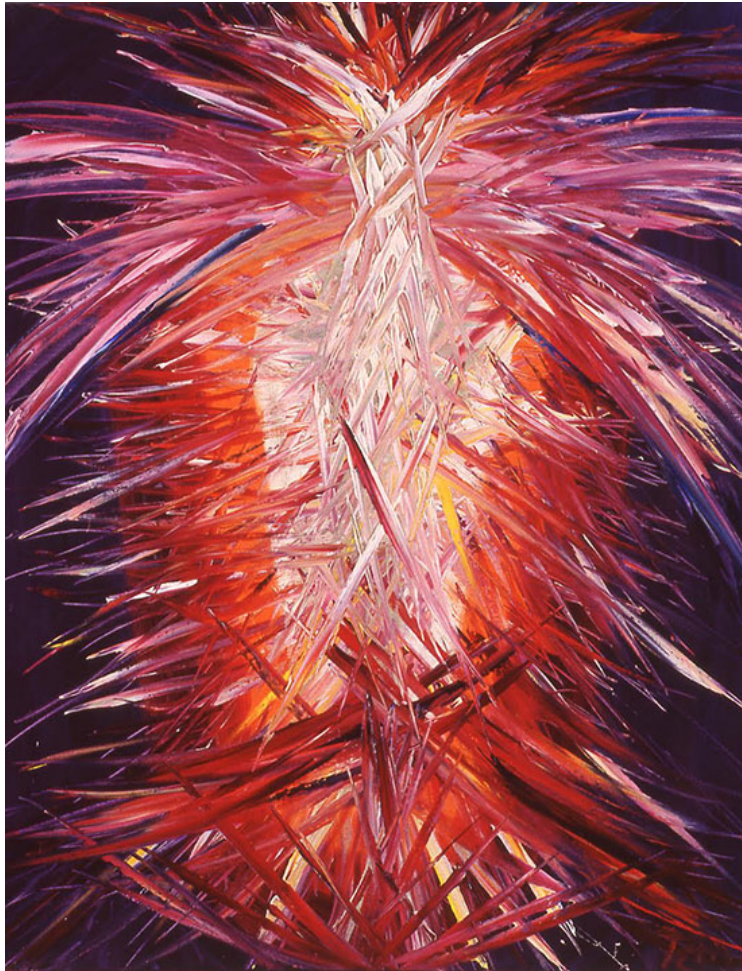
"Mummy II" by Thomas Bühler. Oil, 40 x 32 inches.