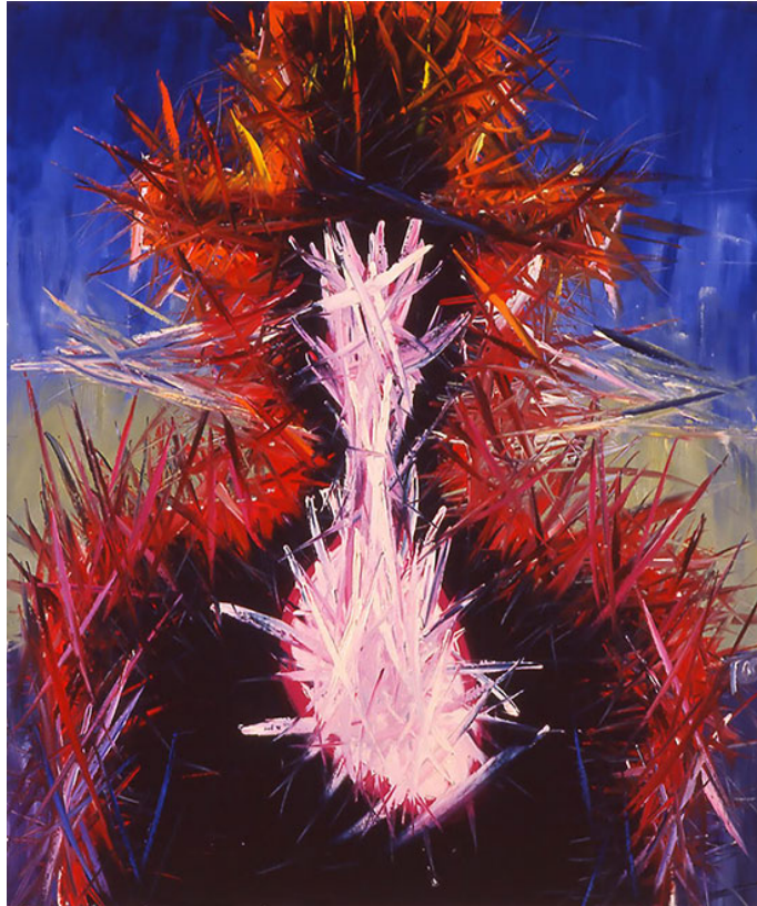
“Black Man” by Thomas Bühler. Oil, 48 x 40 inches. Courtesy of Art Space 98.

“Yellow Bike” by Thomas Bühler. Oil, 40 x 48 inches. Courtesy of Art Space 98.