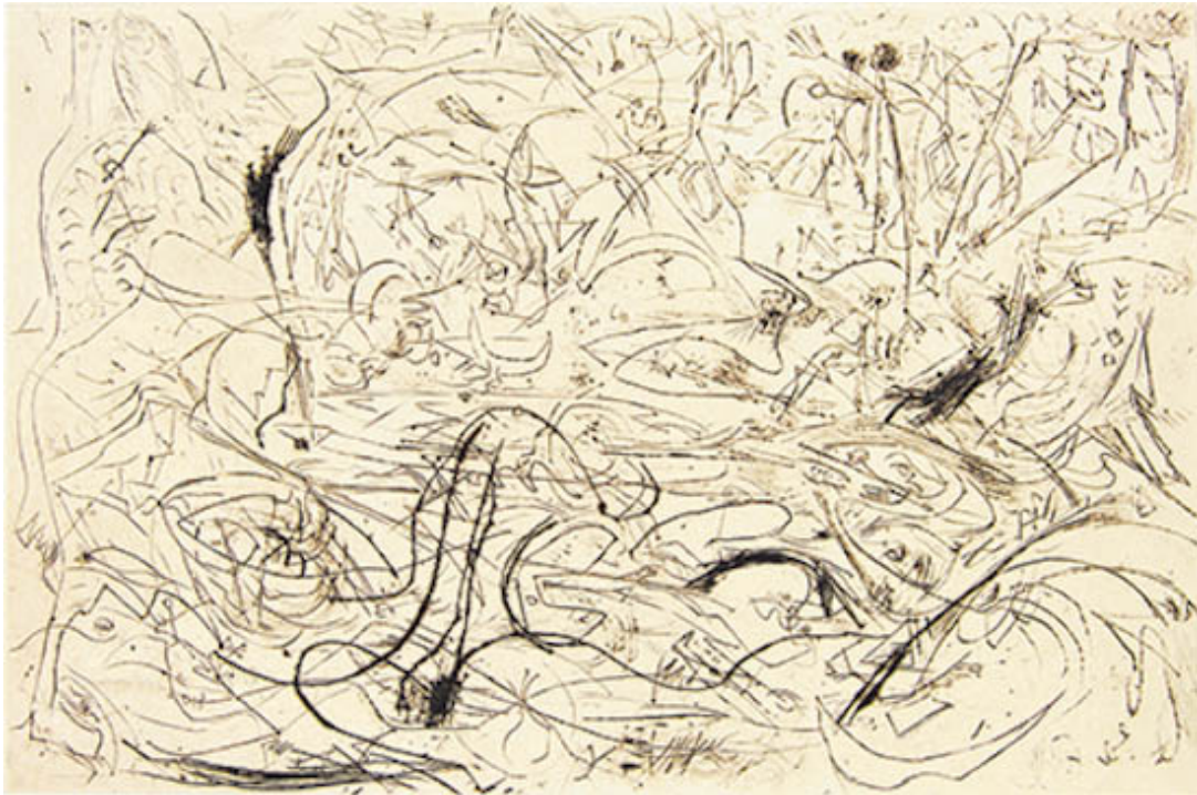
“Untitled, CR1082 (P19)” by Jackson Pollock, c. 1944-45 (printed posthumously in 1967). Engraving and drypoint on white Italia paper, number 11/50 Sheet: 19 13/16 x 27 ¼ in. Image: 15 ¾ x 23 ¾ in.

To read a Hamptons Art Hub review of both shows, visit “ART REVIEW: Beauty by Avedon and Energy in Pollock Prints Paired at Guild Hall.”