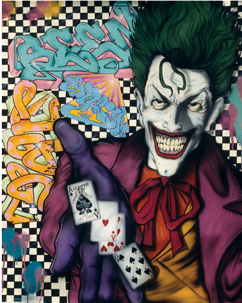
“Dead Man’s Hand” by Domenick S. Vetro, 1988. Oil on canvas.