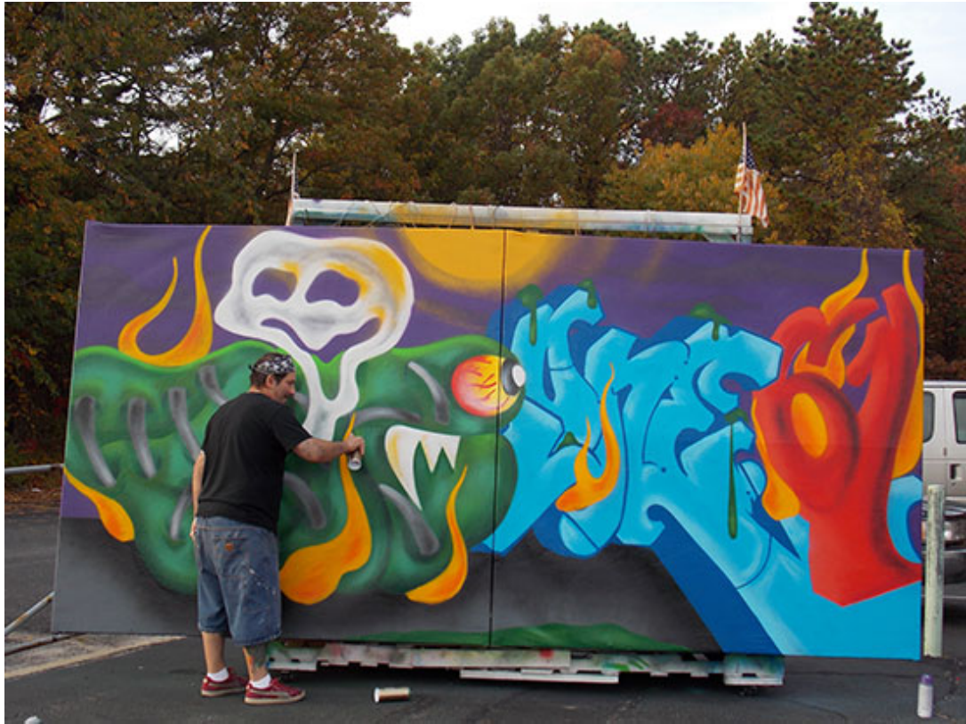
TAG at work.

BASIC FACTS: "UP FROM THE UNDERGROUND" will be on view at The White Room Gallery from October 4 to 22, 2017. An Opening Reception and live graffiti show takes place on Saturday, October 7, 2017 from 6 to 9 p.m. The White Room Gallery is located at 2415 Main Street, Bridgehampton, NY 11932. The gallery is open Wednesday through Sunday from noon to 6 p.m. www.thewhiteroom.gallery .