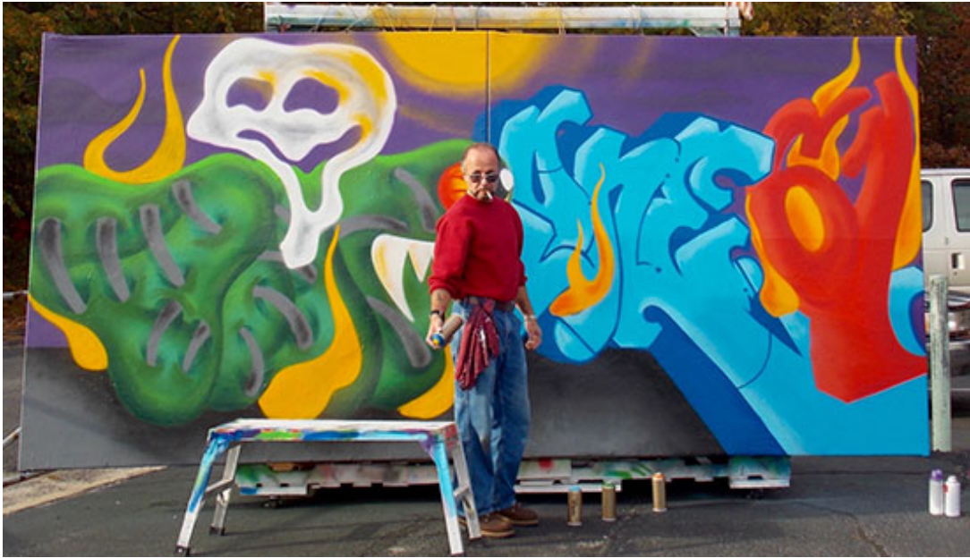
VIC 161 at work.