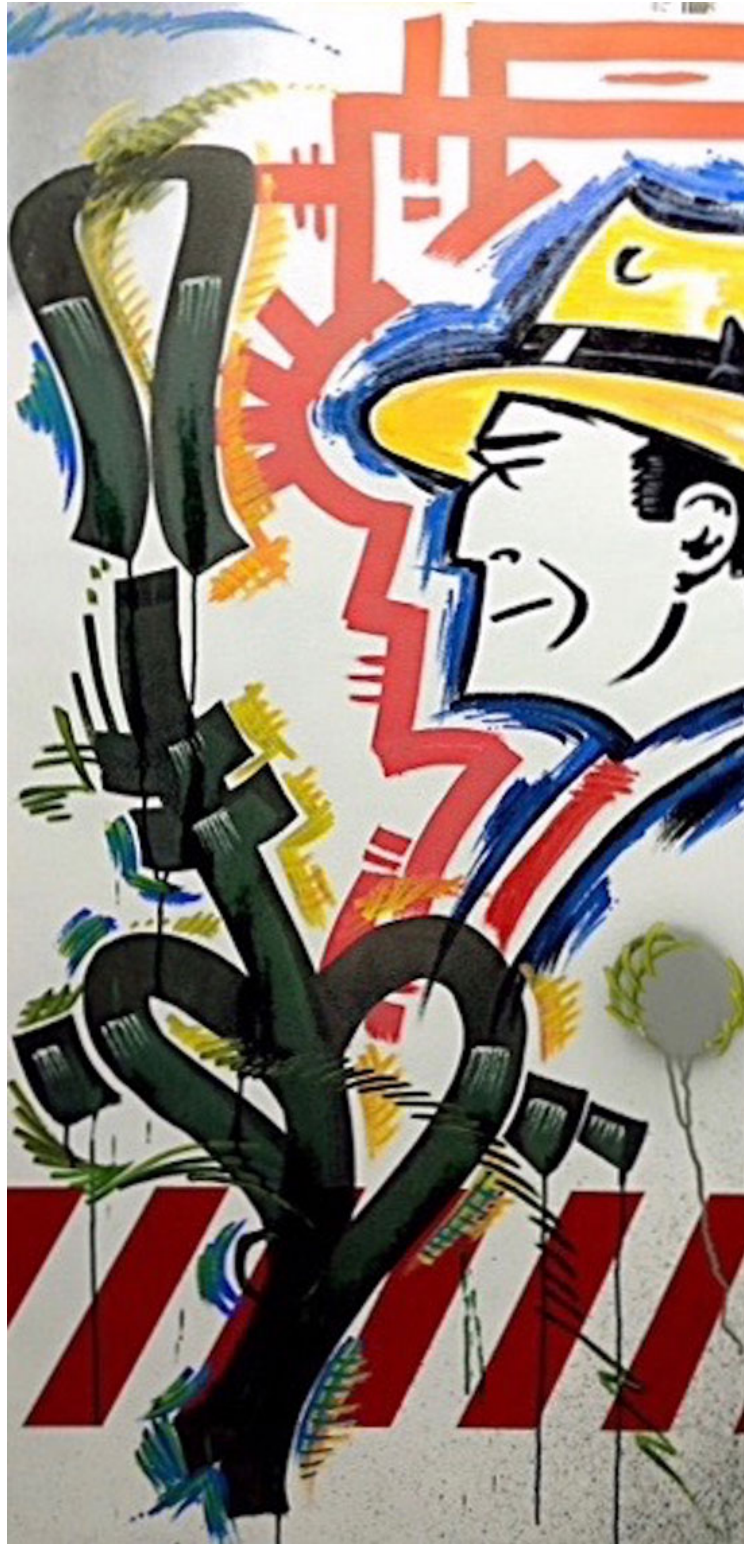
"TRESPASS" by V.P. DEDAJ aka VIC 161. Spray enamel, oil, acrylic on canvas. Courtesy of The White Room Gallery.