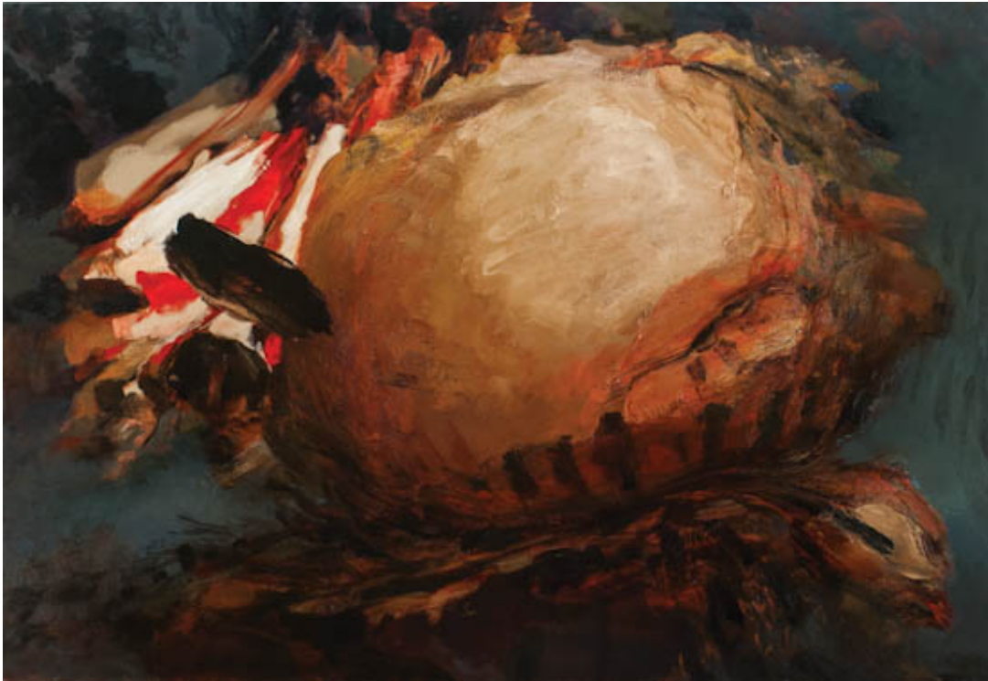
“Untitled 116” by Dana Saulnier, 2016. Oil on linen, 52 x 75 inches.