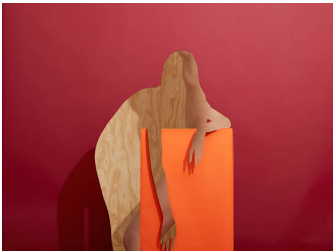
"Kara, Crimson, Marmalade, and Plywood" by Bill Durgin, 2016. 30" x 40", Dye-Sublimation on ChromaLuxe Aluminum, Edition of 5.