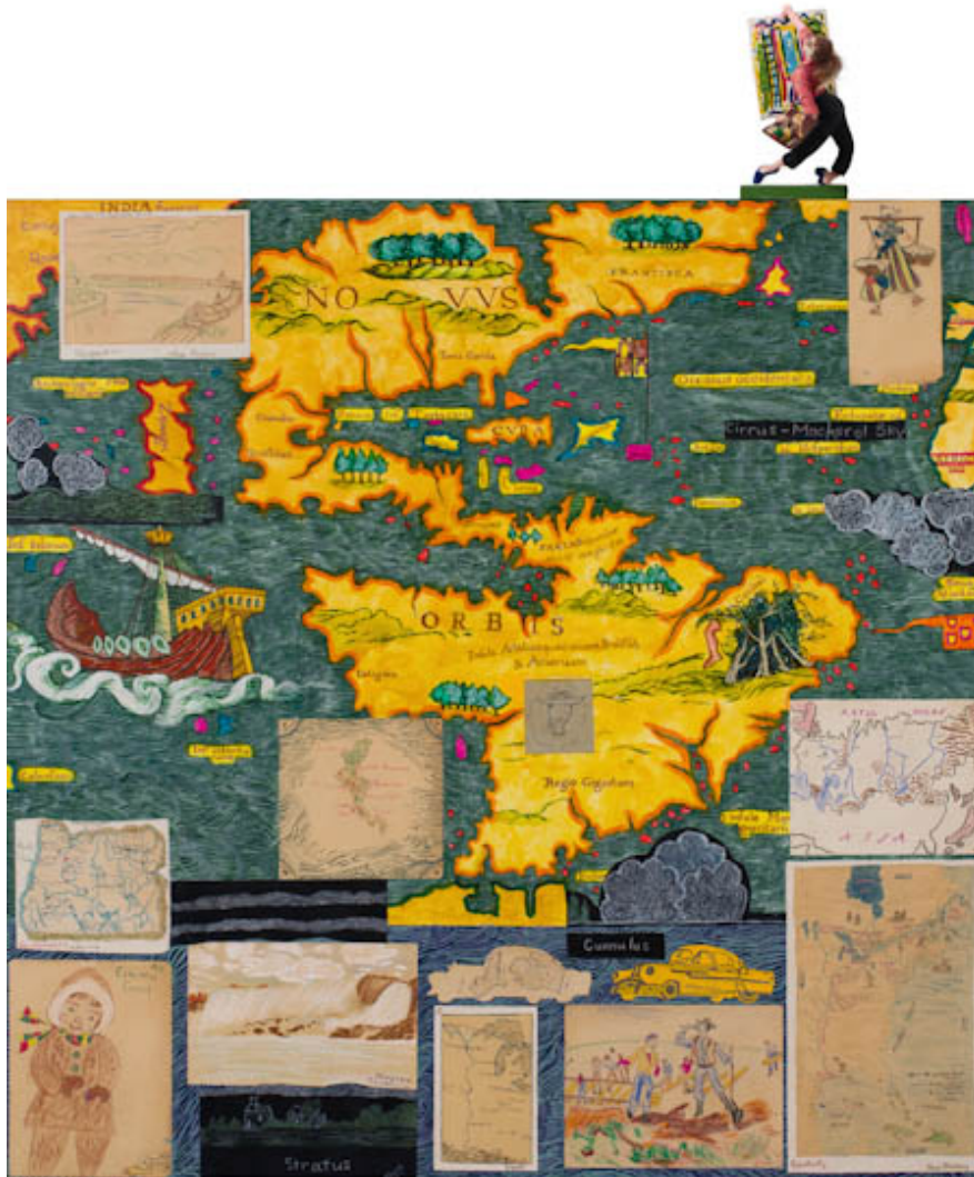
“Art Girl” by Joyce Kozloff, 2017. Acrylic, collage, and found object on canvas. 65 x 54 x 6 1/2 inches.