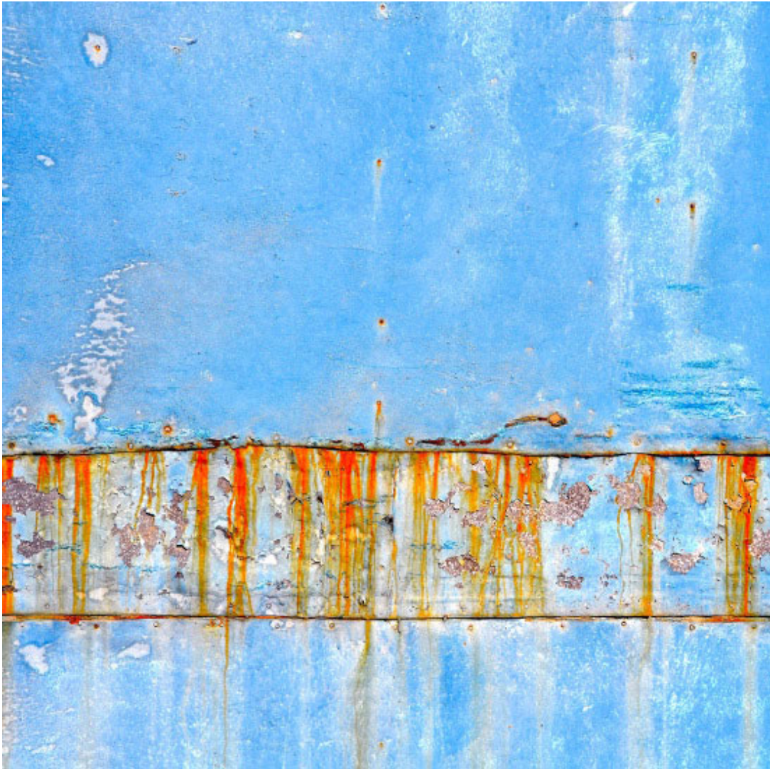
"House Gate, Mongolia #1" by Sasha Sicurella, 2013. Plexi Face Mount Digital Print, 12 x 12 inches. Courtesy of the artist.