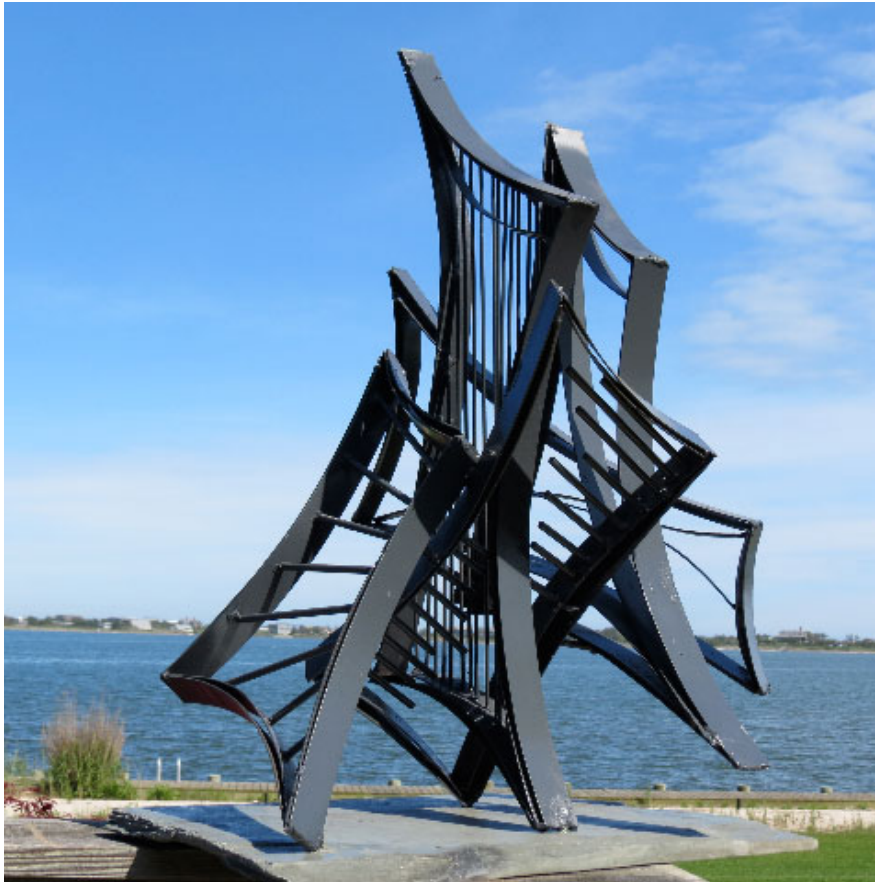
"Quintet" by Don Saco.

Things to Do on the East End is published weekly and presents our selection of the most interesting events in art and culture for the upcoming week and weekend in The Hamptons and on the East End of Long Island. If you're looking for art, visit our Exhibition Finder to see what's on view in the galleries and museums. Click here to start browsing.