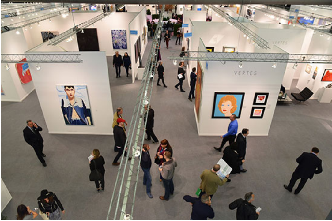
CONTEXT New York.