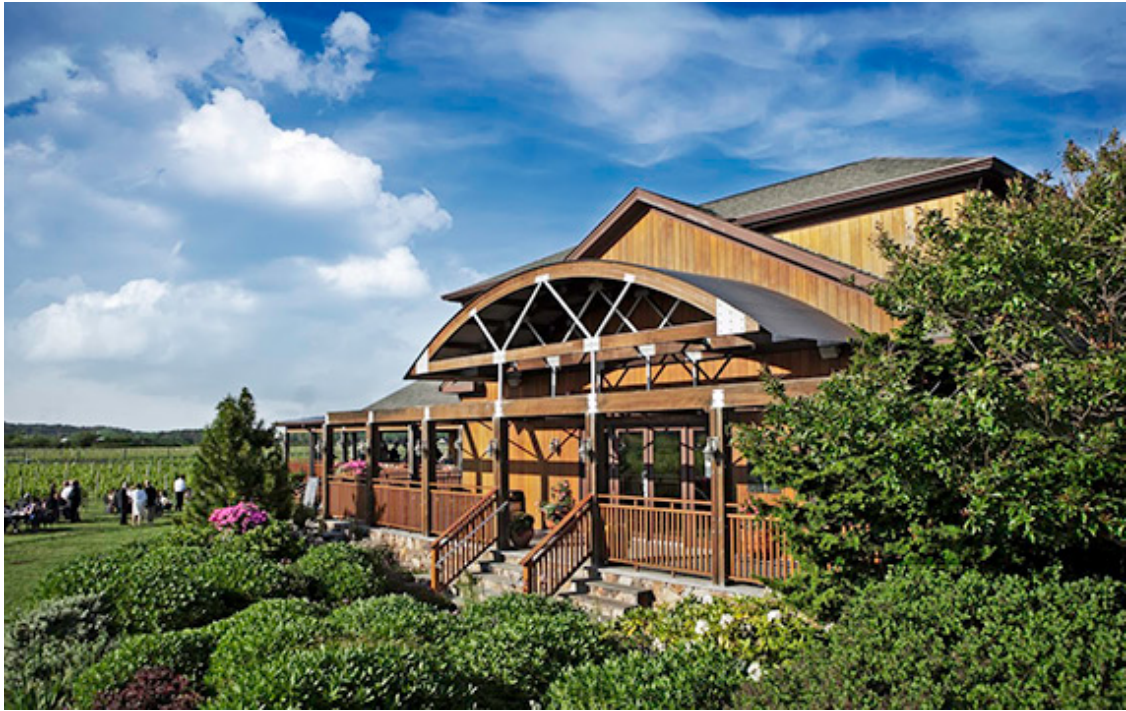
Macari Vineyard in Mattituck is one of the wineries on the the Mattituck-Cutchogue Bus Loop.

Each stop on the two routes provide easy access craft wine and beer purveyors that are steps away from the stop.