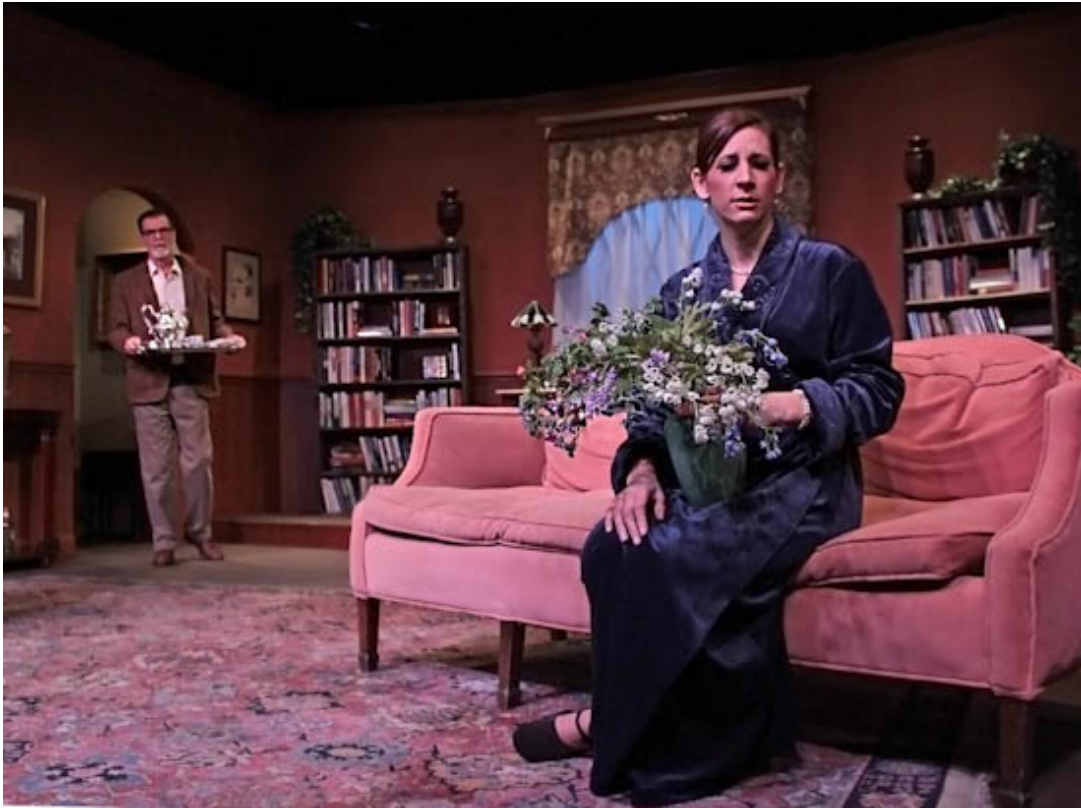
“An Act of the Imagination.”