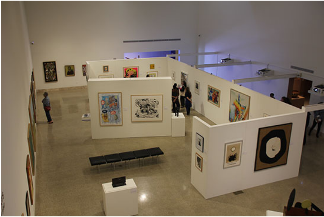
The exhibition space of “An Adventure in the Arts” in the Art Museum of South Texas’ Chapman Gallery.

Every host museum has the freedom to organize the show in its own way, but Miller noted that AMST curated the exhibition in a way that stood out from past shows.