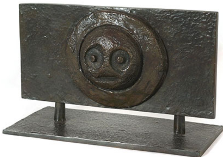
Max Ernst, “Face” by Max Ernst, 1967-68. Bronze, 9 \frac{3}{4} x 15 \frac{1}{4} x 7 \frac{5}{8} inches. Gift of Dallas and Jimmy Ernst.

“ Guild Hall: Adventures in the Arts - Selections from the Permanent Collection ” opened January 17 and runs through April 30, 2017. The exhibition features 72 works from the Guild Hall collection, giving Texas residents and visitors the opportunity to see artwork from a range of distinguished artists, including such 20th century masters as Andy Warhol , Roy Lichtenstein , Jackson Pollock and Chuck Close . The works date back to Impressionism in the 1870s and progress through practically every succeeding modern art movement—Surrealism, Abstract Expressionism, Pop art and more—up to the art of the 1980s and '90s.