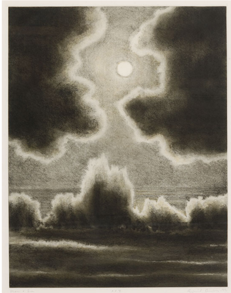
“Moon and Sea” by April Gornik, 1991. Aquatint, 23 x 18 inches. Gift of Ambassador Richard Holbrooke.

As much as this show celebrates the artists and their work, it also serves as a history lesson on the East Hampton art colony. The 60 artists showcased have all played a role in making East Hampton flourish as an art and culture hub for more than a century.