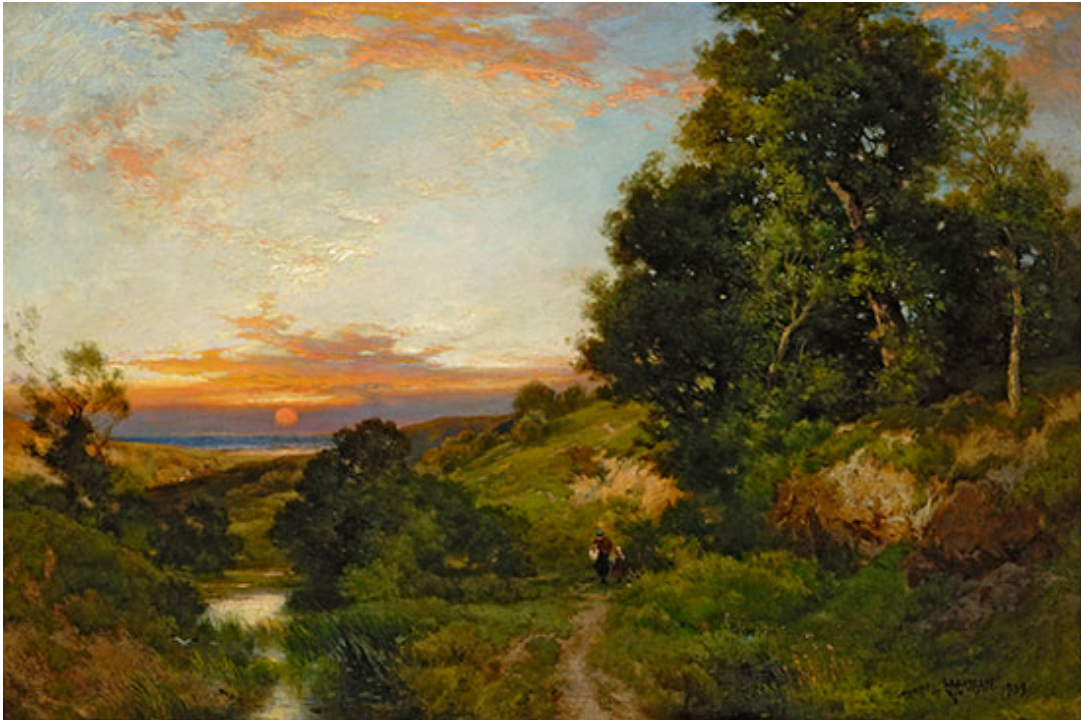
“A Midsummer Day, East Hampton, Long Island” by Thomas Moran, 1903. Oil on canvas/board, 13 1/3 x 19 1/2 inches. Purchased through the Art Acquisitions Fund.

As part of the educational aspect of the exhibition, Miller traveled to AMST for the January 27, 2017 opening to give a lecture on the art colony of East Hampton in The Hamptons. She pulled pieces from the show to illustrate the different art movements over time.