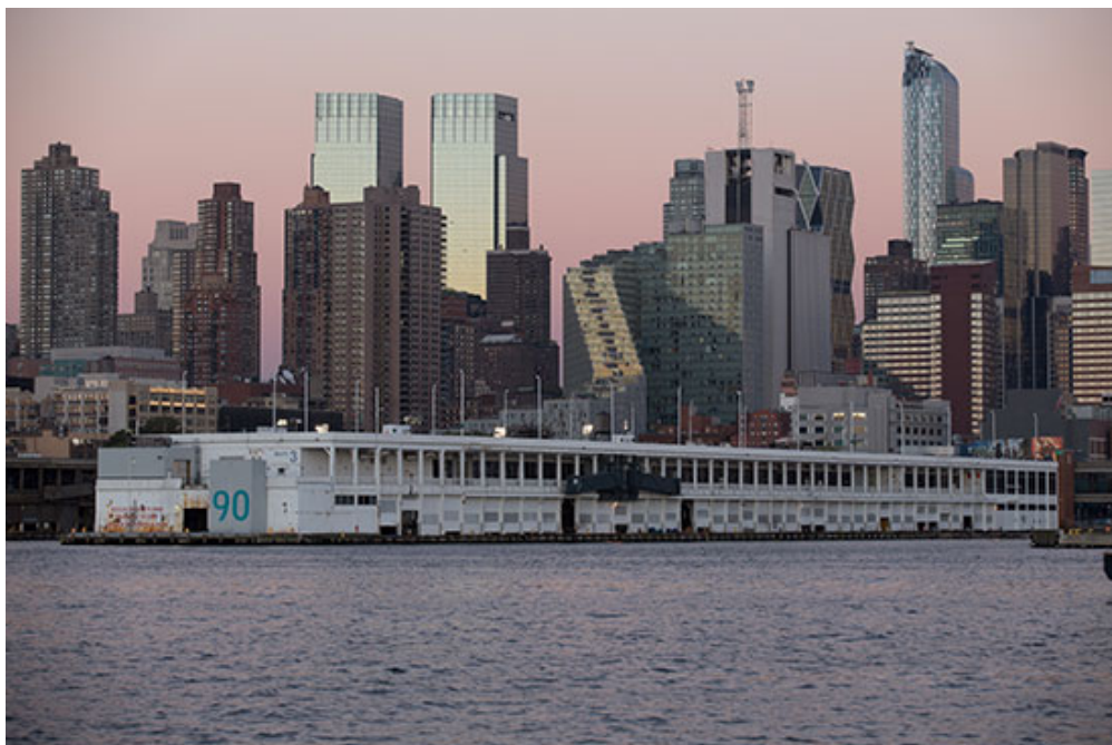
VOLTA NY at Pier 90.

RELATED: CRITIC’S VIEW: VOLTA, Taking on The Big Boys by Gabrielle Selz. Published March 7, 2015.