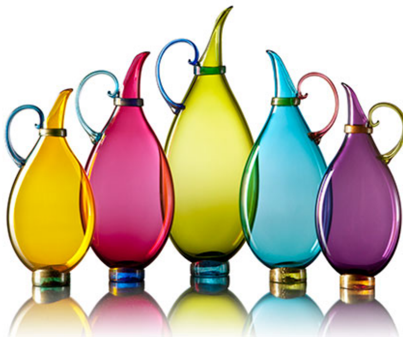
“Flat Pitcher Collection” by Vetro Vero (Michael Schunke & Josie Gluck).

The New York Ceramics and Glass Fair is located at Bohemian National Hall, 321 East 73rd Street, New York, NY 10021. www.nyceramicsandglass.com .