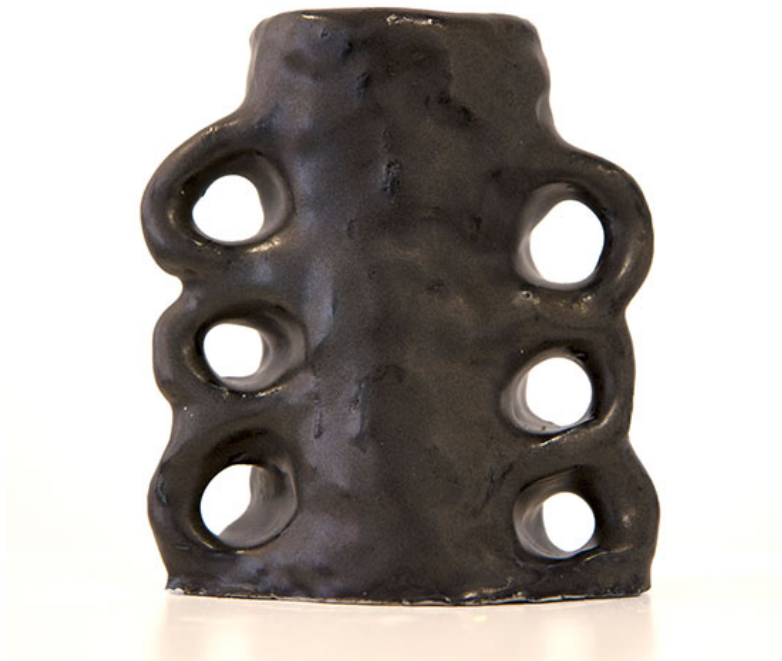
"Knuckle Vase" by Greg Haberny, 2016. GH ash black, glaze, porcelain, 6 x 5.5 x 3.5 inches. © Catinca Tabacaru Gallery. Courtesy of the gallery and the artist.