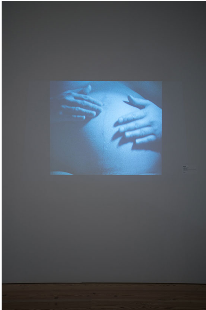
installation view of "Antepartum" by Mary Kelly, 1973. Super 8 film transferred to video, black-and-white, silent; 1:30 min. looped. Whitney Museum of American Art, New York; gift of the artist.