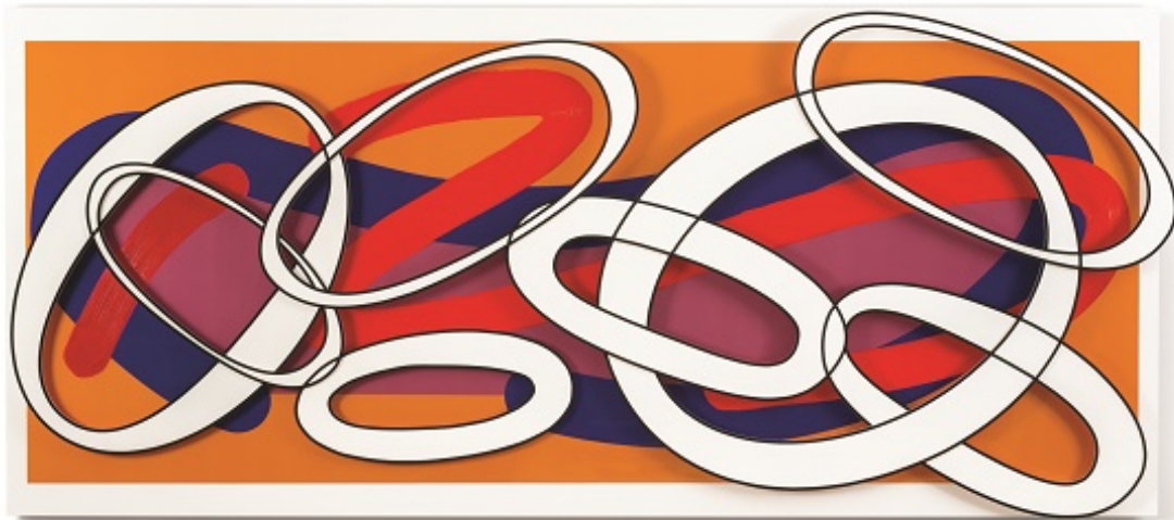
"Orange Signature" by Liz Sloan, 2016. Sintra, flex print, acrylic paint, acrylic. 38 x 86 x 3 inches.

The special presentation at Scope is titled "Visual Looping" to emphasize the geometric resonance of the artist's compositions. Sloan's aesthetic melds a classically Modernist commitment to geometry with elements of Asian artistic and spiritual principles; the connection is harmonized by the deft personal touch of this painter and master of design.