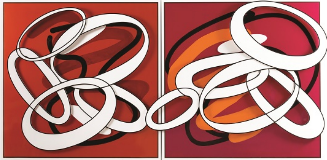
“Befriended” by Liz Sloan, 2016. Sintra, flex print, acrylic paint, acrylic. 48 x 96 x 3 inches.

There is a metaphysical dimension to the way Sloan delves the oval as motif, just as she channeled the Ki or life energy so essential to an understanding of Zen. As she says, “Ovals are the subject of my art. They illustrate movement in the physical world and possess kinetic energy. They release emotion—highlighting optimism, flexibility, balance and melody. The motion of drawing an oval reflects something elemental about oneself. It’s an intuitive gesture, meant to be experienced in the present.”