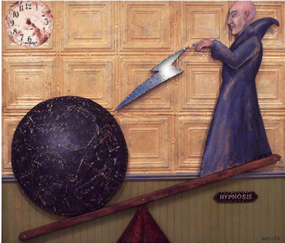
“The Hypnotist” by Charles Waller.