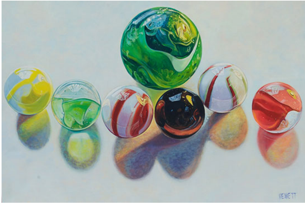
"Marbles" by Scott Hewett.