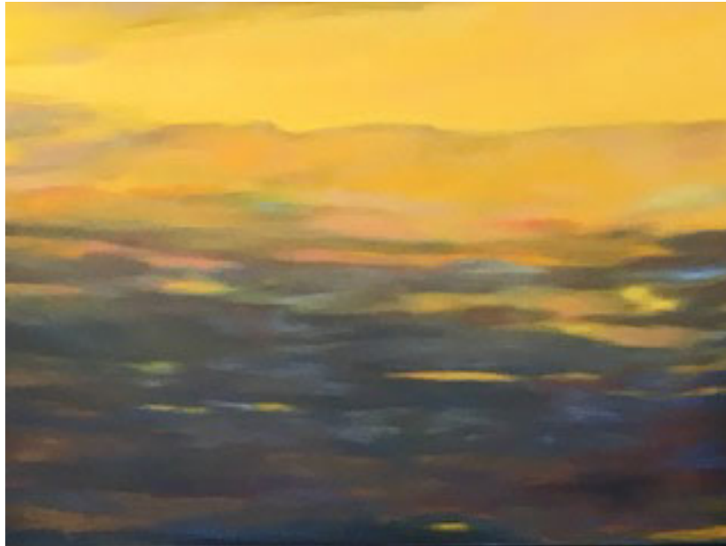
"Seascape" by Sally Breen.