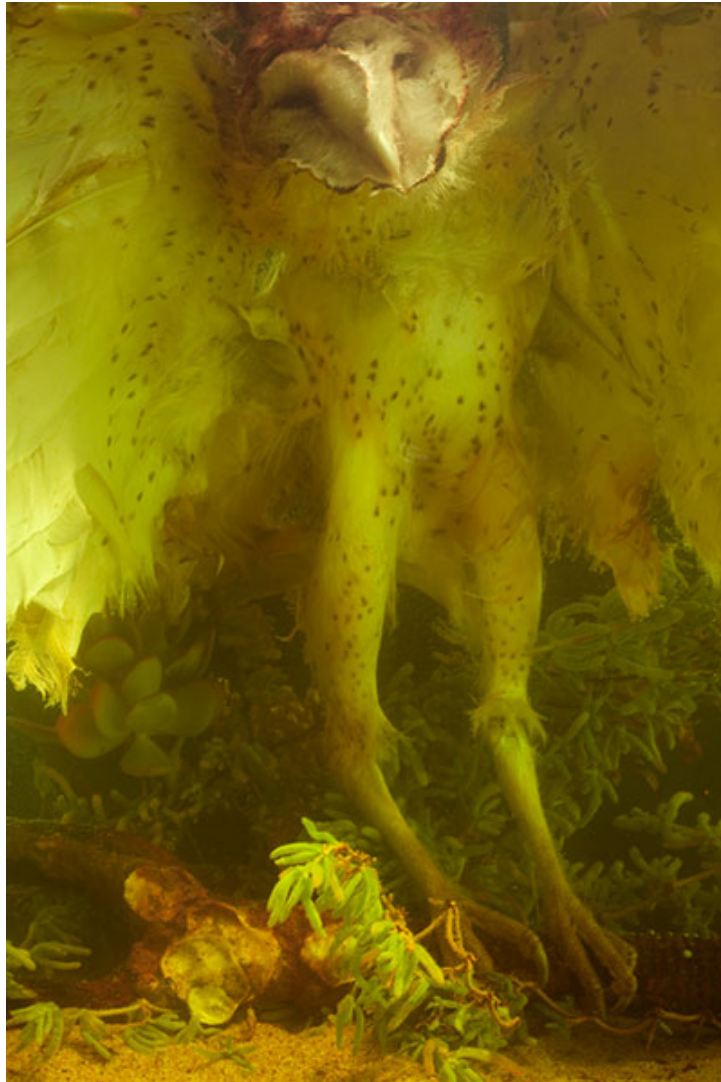
“Barn Owl” by Bobby Neel Adams, 2014. Digital inkjet on rag paper, 12.67 x 19 inches.

A Special Event will be held on Sunday, September 25 at 3 p.m. in conjunction with Ghost of a Dream’s exhibition “When the Smoke Clears: The Fair Housing Project.” The panel discussion will be about the current state of the Art Fair and the Art Market.