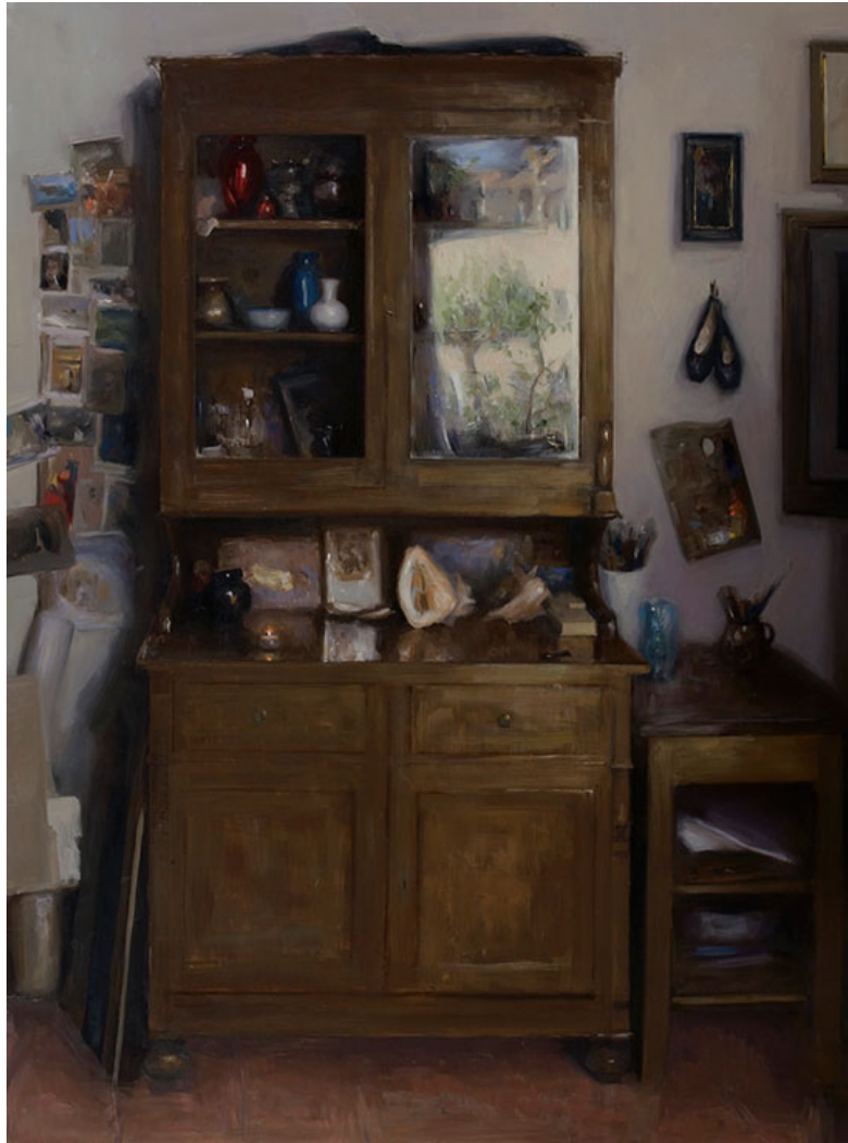
“Collecting Memories” by Melissa Franklin Sanchez, 2016. Oil on aluminum, 30 x 40 inches.

I love a painting that makes the viewer work hard, and Collecting Memories puts the viewer to the test. Really three paintings in one, this pensive view takes its place in a rich tradition shared by such distinguished predecessors as Gerome , Matisse , Braque , Picasso , and Giacometti . (A major exhibition devoted to the theme as interpreted by these artists and others held at Gagosian Gallery was reviewed here .)