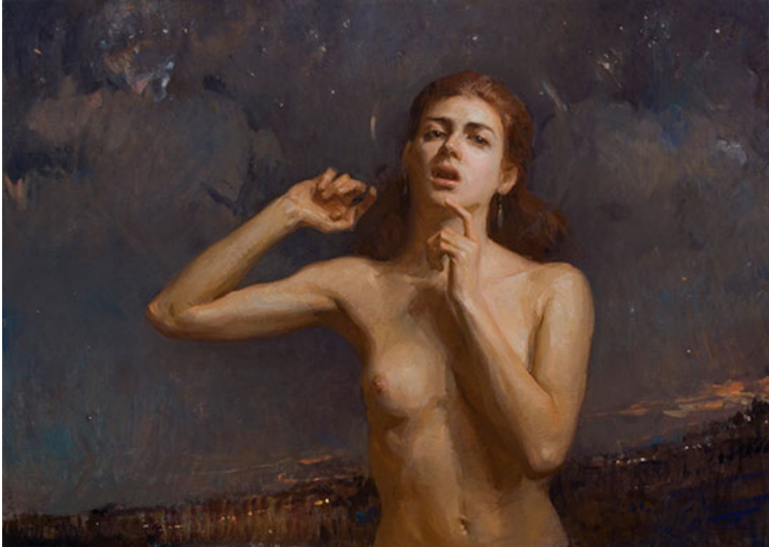
"Allegory of Chopin (Nocturne)" by Ramiro, 2016. Oil on canvas, 29.5 x 41.5 inches.

legato as fluid as operatic singing (the real meaning of the dynamic indication cantabile ).