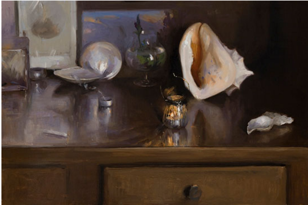
"Remember Me" by Melissa Franklin Sanchez, 2016. Oil on aluminum, 19.6 x 29.5 inches.

burn hotter than others, such as the cranberry red of the glass vase or the burnished pink-orange inside of a conch in Collecting Memories , or the glowing ember at the tip of a candle wick in Remember Me , an elegiac still life. An artist's statement on what subject matter attracts her has a wistful quality: "I am naturally drawn to aspects of life that transcend time, moments that could have been yesterday, today or perhaps tomorrow."