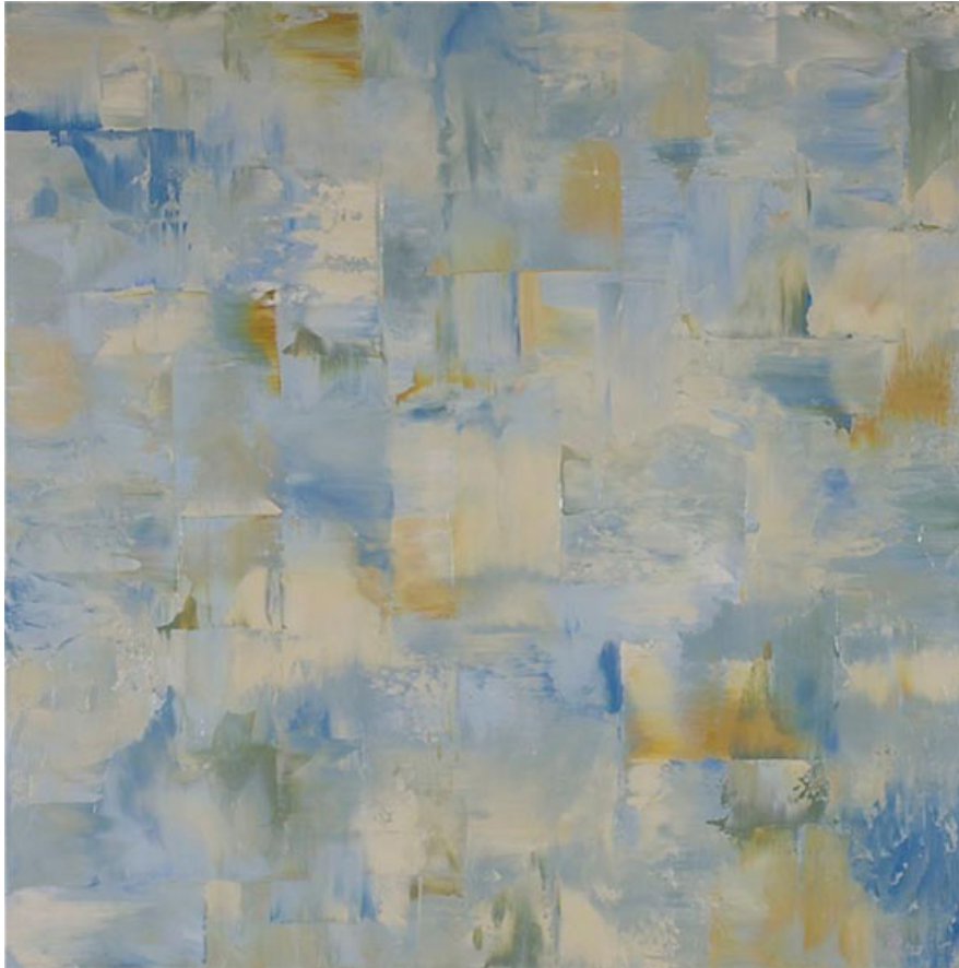
“Bedroom Slippers” by Jill Krutick.

My work is influenced by the Impressionists and Abstract Expressionists. My daily activities coupled with my eco-travels provide me with the content from which to develop creative ideas. I am passionate about “collecting” colors, shapes and textures wherever I go. My paintings often reveal glimpses of recognizable forms, which uncovers insights into a viewer’s emotional state as well as my own.