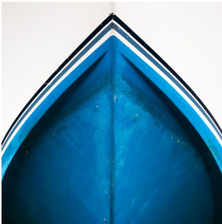
“Reel Time” by Michele Dragonetti.

transform often humble vessels into abstract portraits, celebrating their imperfect appeal.