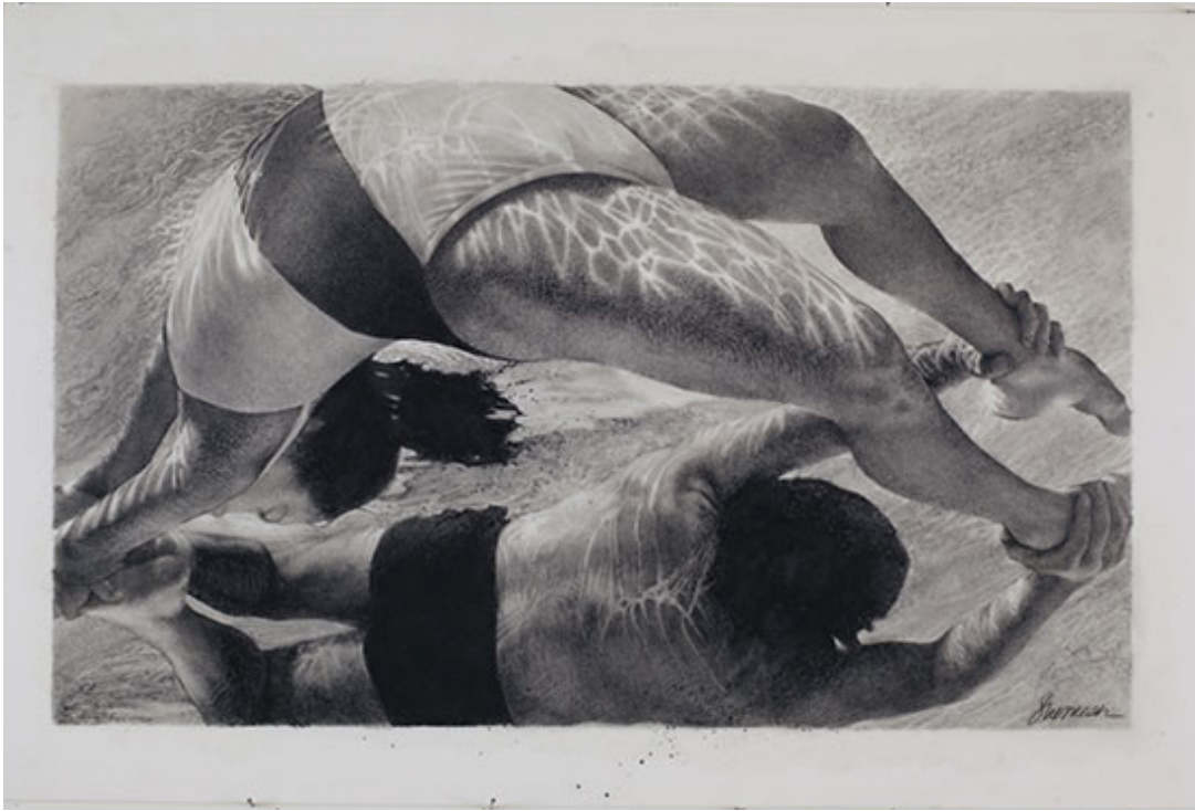
“Bridge” by Lorraine Shemesh, 2011. Graphite wash on mylar, 22 x 37 inches.

That web of light, like a loose craquelure across the curvature of their limbs, is one of the most active chromatic passages in the painting, with a flickering spectrum of golds and tangerine strokes infiltrating the blue of the pool and sky. Discretely hung in a different part of the gallery, a second drawing, the most “abstract” moment in the show, is a loose pencil version of the ghostly figures that just hints at the final work.