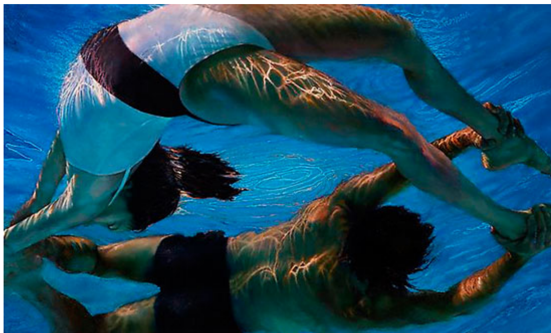
"Bridge" by Lorraine Shemesh, 2011. Oil on canvas, 47 1/2 x 79 inches.

It is enough of a challenge for even the most adept and dedicated artist at life drawing sessions to hold together the proportions and shadows in a double figure pose such as Bridge , the most compelling composition in the show. Bridge gains impact and effectiveness from the absence of all the restless deformations of disturbed water, rendering it the most secure composition in the exhibition.