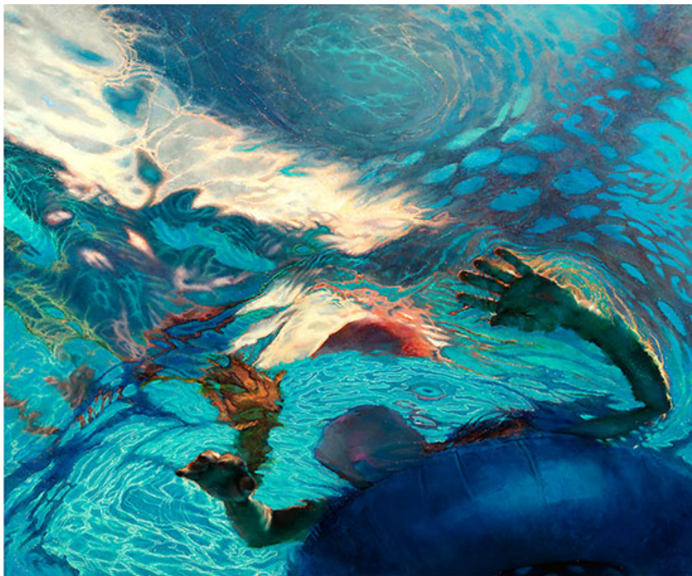
"Surrender" by Lorraine Shemesh, 2015. Oil on canvas, 58 x 70 inches.

Summer looks irresistible in the vertiginous Surrender , one of seven large oil on canvas paintings that display this accomplished figurative artist at her most virtuosic, stirring a hyperactive maze of light effects in views of a pair of outstretched hands lazily drifting outside a big indigo inner tube, as seen from the bottom of the deep end.