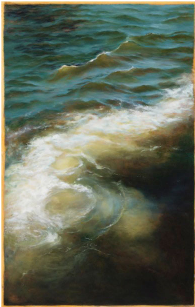
“Ocean Composition 2 (The Last Wave)” by Livia Mosanu, 2015. Oil on shellacked Arches watercolor paper, 70 x 45 inches.