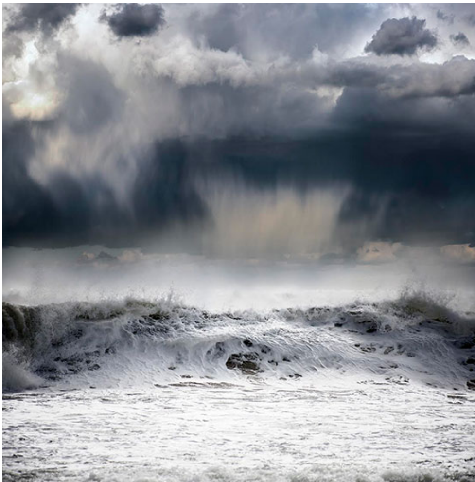
“White Water” by Dalton Portella, 2013. Photograph, various sizes.