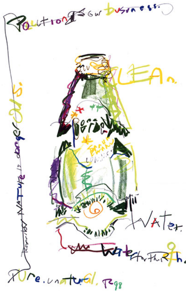
"PERRIER" by Roz Dimon, 1998. Mixed media on bristol, 14 x 11 inches.