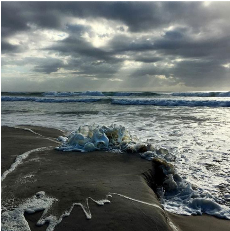
"WHISPER, ROAR, GUSH II" by Jane Martin, 2016. Archival pigment print on Metallic Pearl Paper, Edition 1/15, 24 x 24 inches.