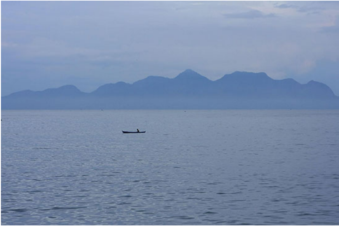
“Dreaming, Maumere, Bali” by Joel Lefkowitz, 2008. Archival digital print, 19.5 x 25.5, framed.