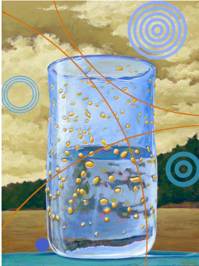
“Half Full Half Flat, Becket” by Scott McIntire, 2010. Enamel on canvas, 24 x 18 inches.