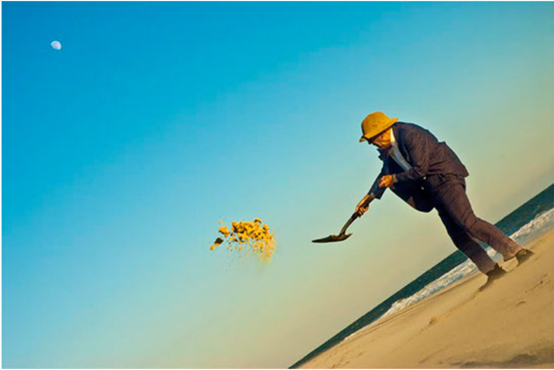
"Sisyphus" by Christina Stow, 2009. Archival digital print, 14 x 11 inches.