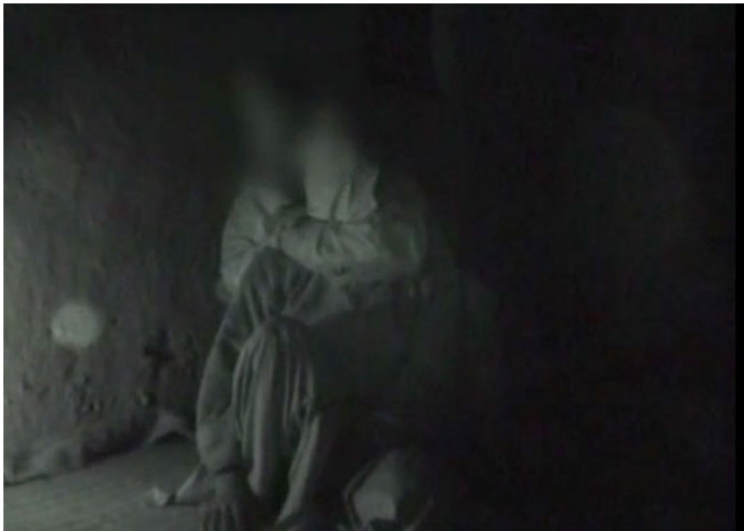
“still from O’Say Can You See 2001/2016.” by Laura Poitras (b. 1964). Two-channel digital video, color, sound. Courtesy the artist