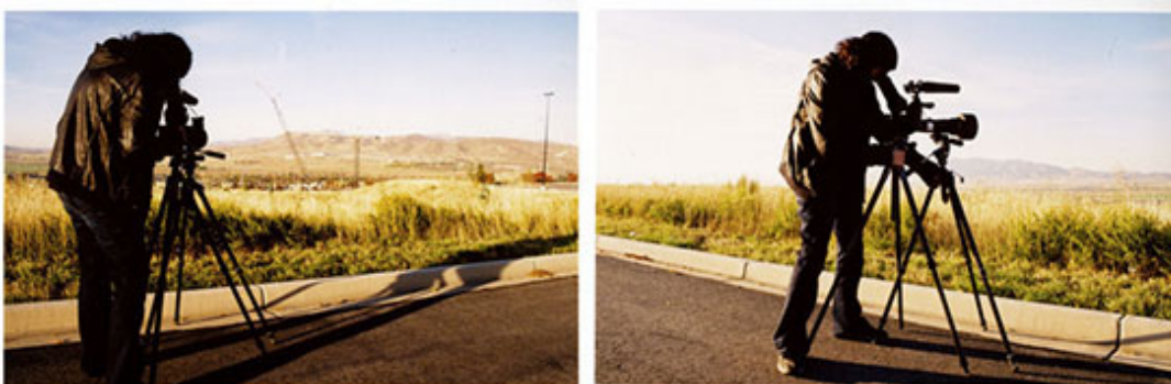
“Laura Poitras filming the NSA Utah Data Repository construction in 2011.” by Laura Poitras (b. 1964).