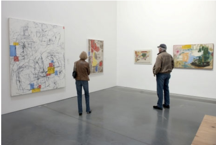
The Parrish Art Museum's Permanent Collection.