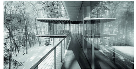
GLASS | WOOD Erieta Attali on Kengo Kuma