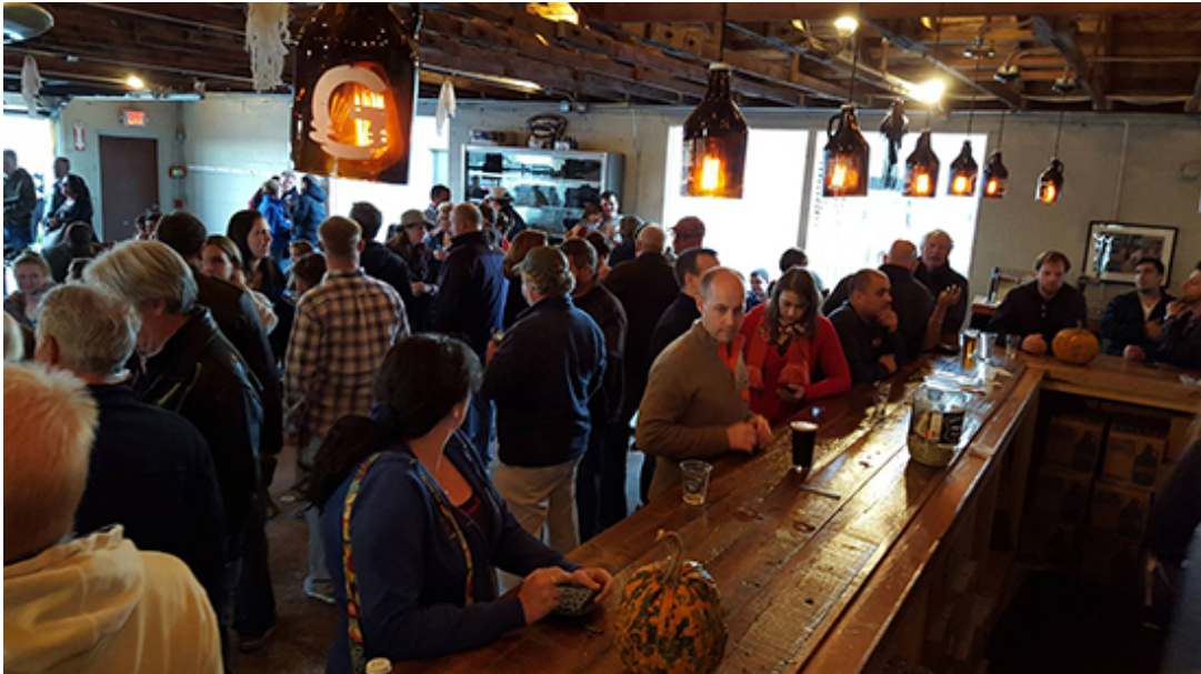
The tasting room at Greenport Harbor Brewing Company's Peconic location.