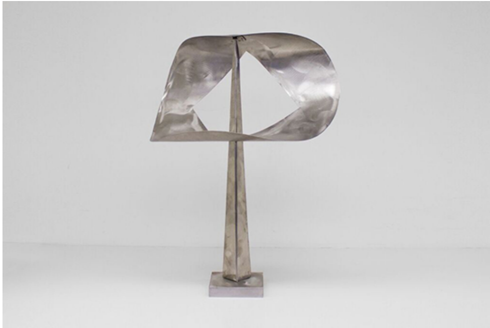
"Beacon II" by George Rickey, 2001. Stainless steel, 24 x 19 x 6 inches.

A color etching by Richard Serra and a day at Chatsworth with the Duke of Devonshire for up to six people are among the art and times for bid at Storm King's 2015 Gala held in New York City.