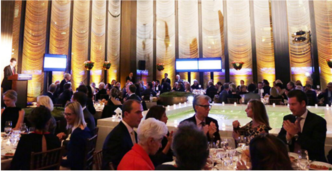
2014 Storm King Fall Gala.

Bids are already being accepted online. Click here to view online and place a pre-bid. Among the offerings are sculptures by George Rickey, Joel Shapiro and Lynda Benglis, whose work is currently the subject of a special exhibition at Storm King Art Center.