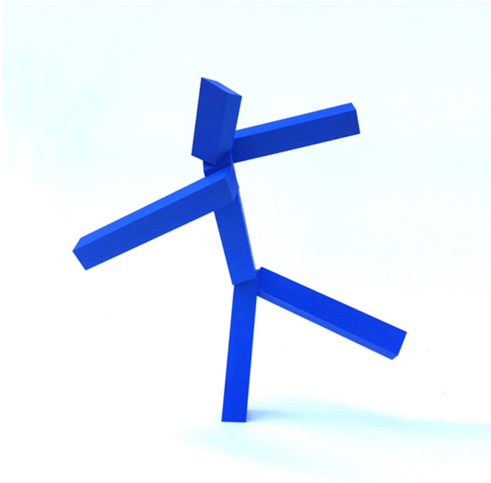
“untitled (blue)” by Joel Shapiro, 2015. Wood and casein, 14 5/8 x 14 1/4 x 6 3/8 inches.