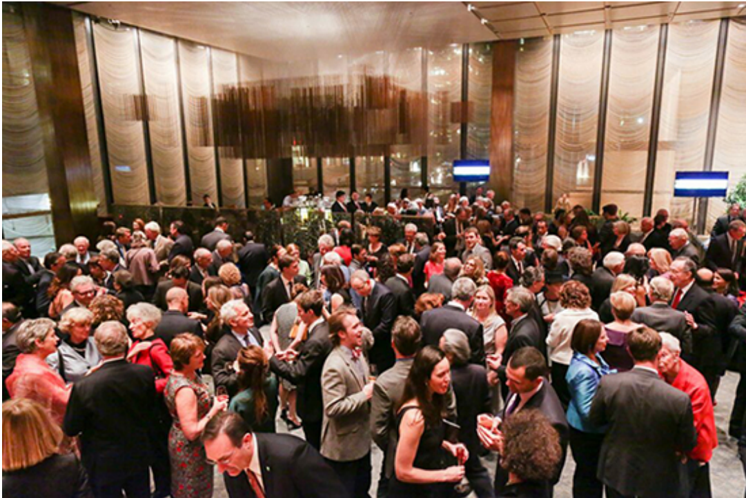
2014 Storm King Fall Gala.

Storm King holds its sixth annual gala dinner and live auction on October 1, 2015 at the Four Seasons in New York. The benefit honors The Duke of Devonshire and artist Andy Goldsworthy . The evening features cocktails, dinner and a live auction featuring works by Lynda Benglis , George Rickey , Richard Serra and Joel Shapiro .