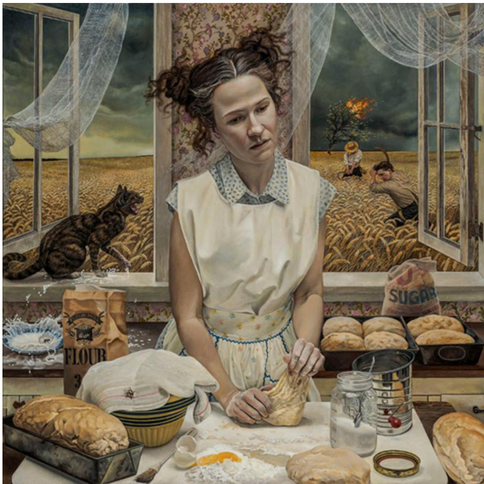
"In the Distance" by Andrea Kowch, 2015. Acrylic on canvas, 36 x 36 inches.

"Across a Rural Skyline" remains on view through October 4, 2015. RJD Gallery is located at 90 Main Street, Sag Harbor NY 11963. www.rjdgallery.com .