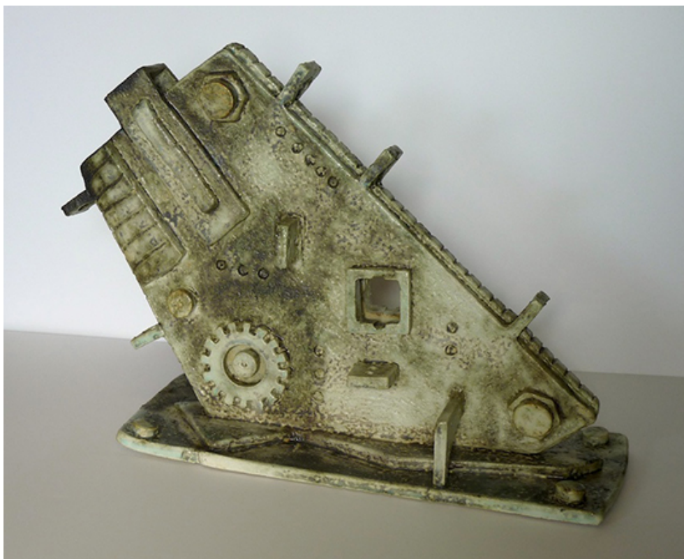
"SLIVER" by Bob Bachler, 2015. Stoneware with Oxide Wash, 13 x 15 x 6 inches.