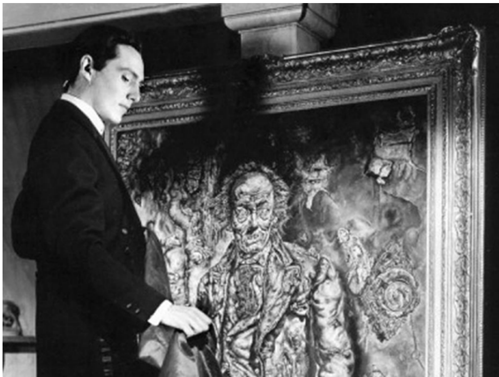
Still from Albert Lewin, "The Picture of Dorian Gray," 1945 (110 min.)