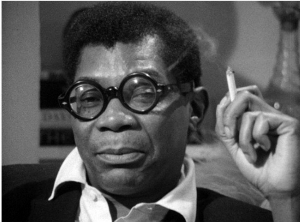
Still from Shirley Clarke, "Portrait of Jason," 1967 (105 min.)